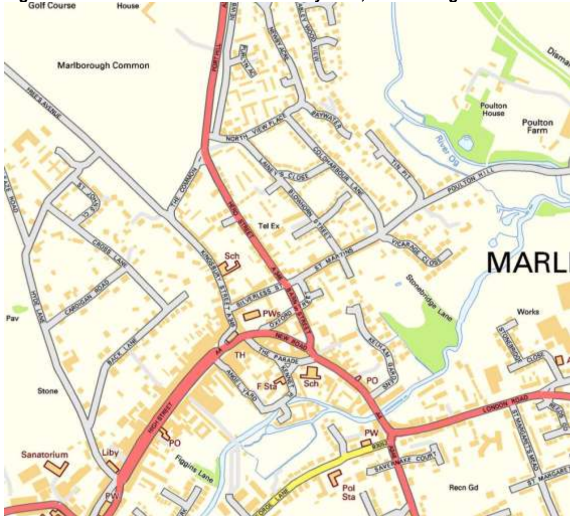
Figure 1.1 – Location of Herd Street study area, Marlborough