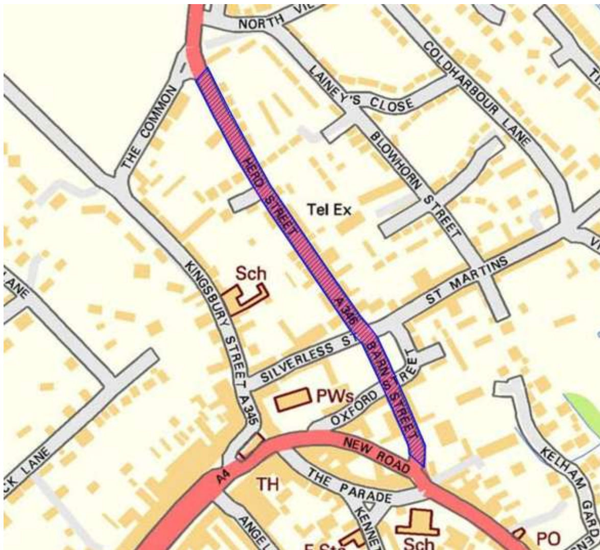
Figure 3.1 Predicted area of exceedence

© Crown copyright. All rights reserved. 100049050, 2010