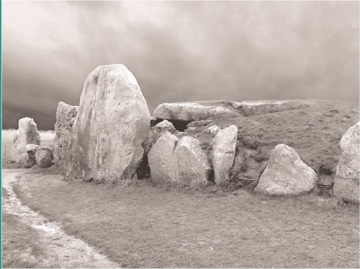
The facade of West Kennet Long Barrow