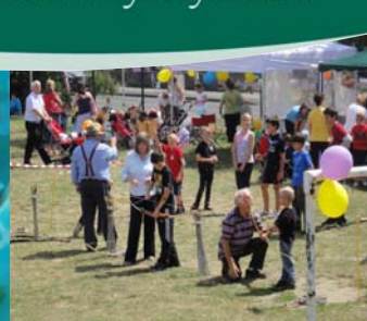
Images from Play Day 2010 - Devizes Brickley Lane event (2 August)