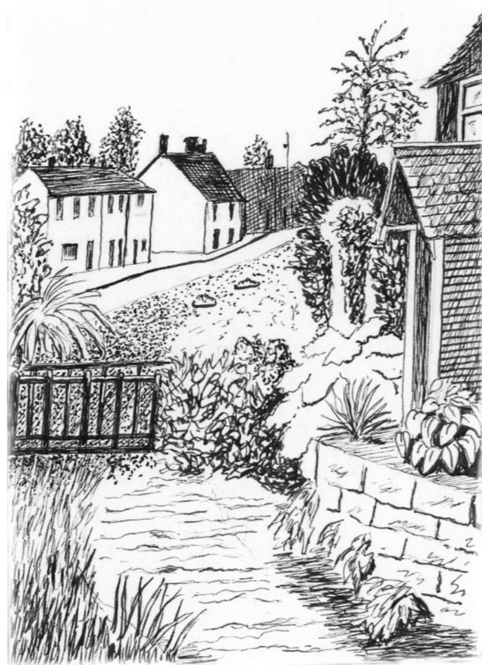
The Brook and the High Street

The village school closed in 1971 and, despite many protests, it was demolished in 1973. There were two shops, one of which was also a Post Office; both are now closed. In recent years, the planning policy of the local council has permitted only small-scale development and this meets with wide approval.