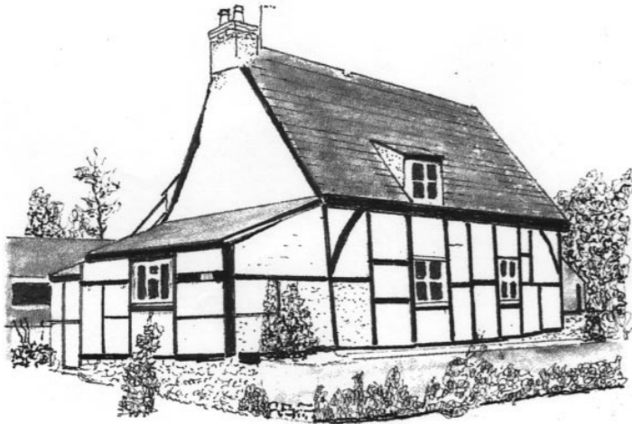
Four Winds, Eastcott