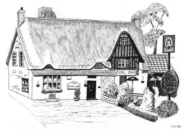
Royal Oak Inn