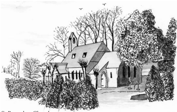
St Barnabas Church