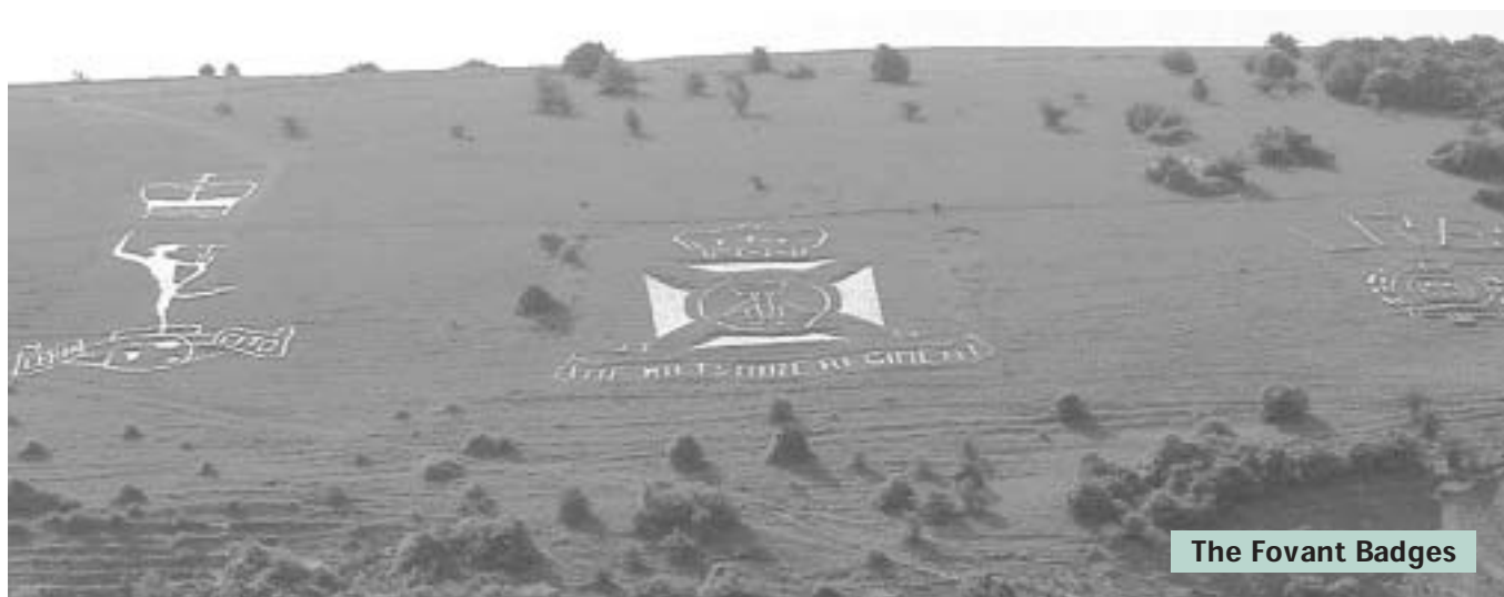
The Fovant Badges