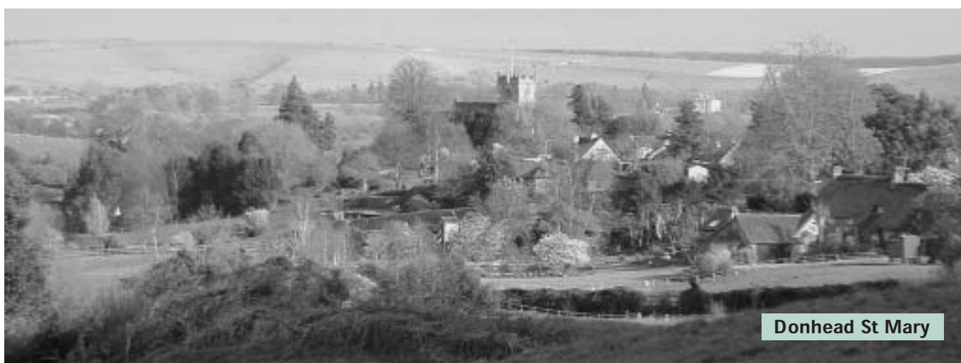
Donhead St Mary