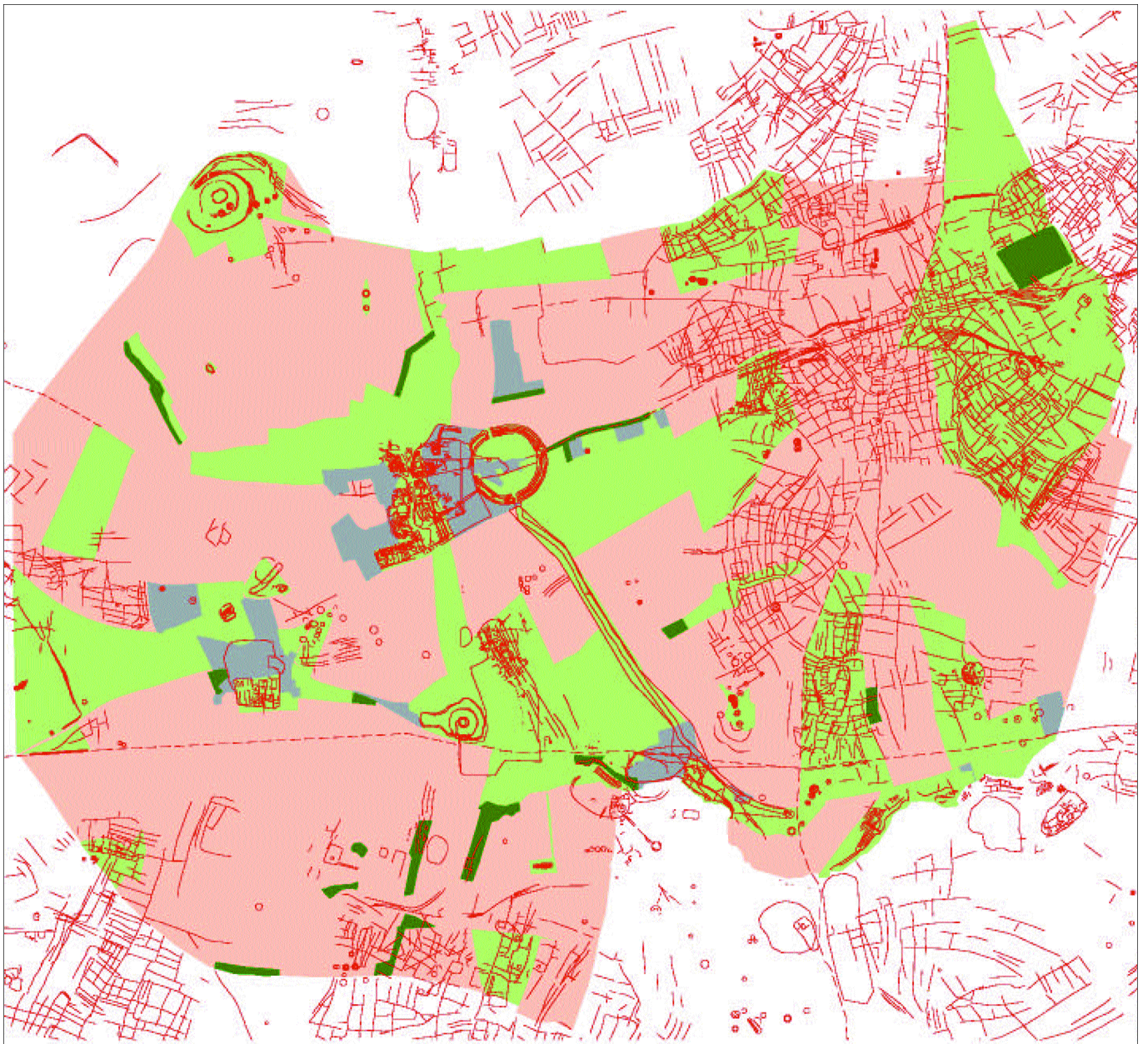
Figure 3: Land Use and Archaeology