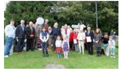
West Dean, winner of the small village category