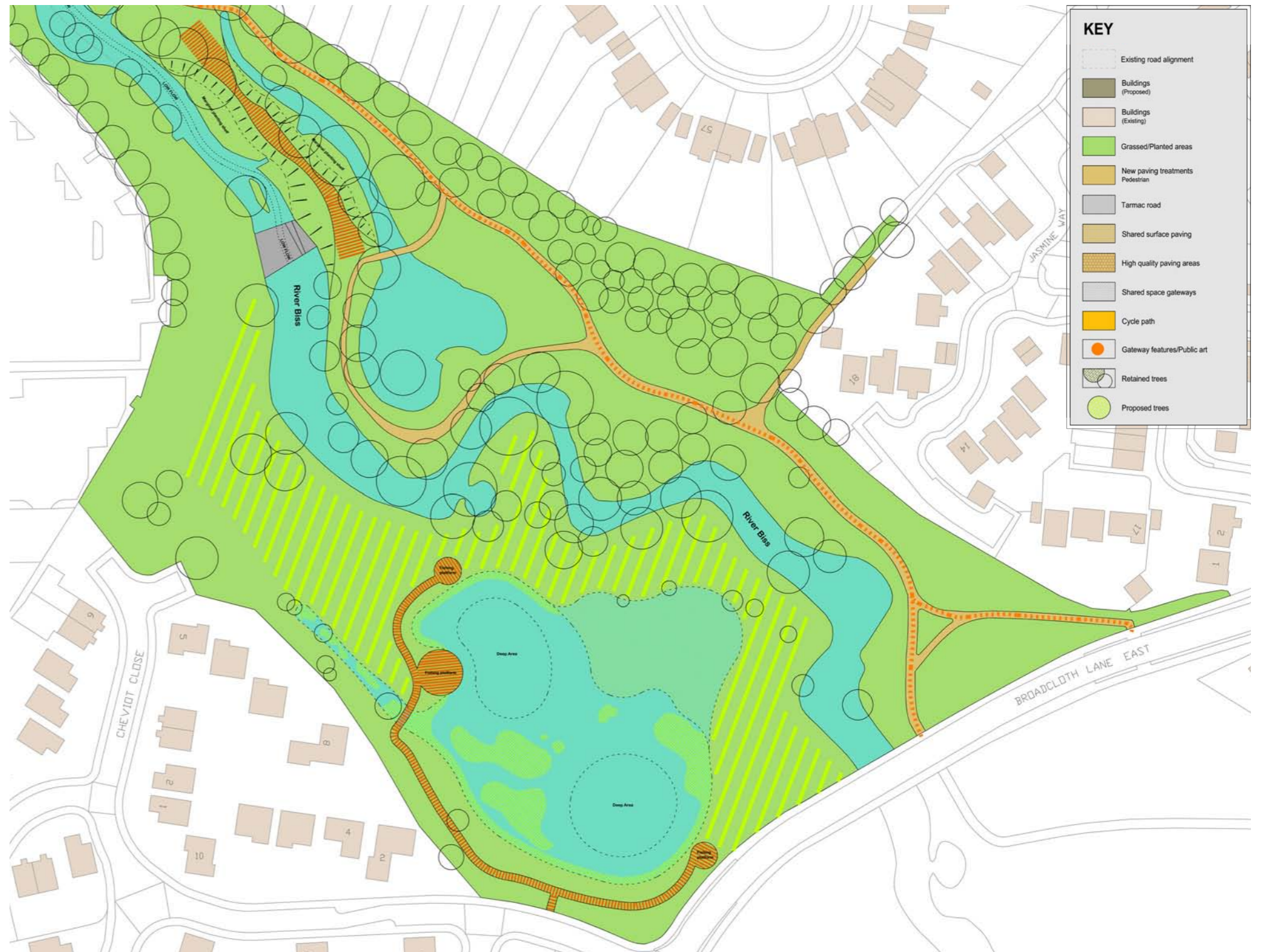
Figure 9.18: Biss Meadows illustrative public realm proposals.