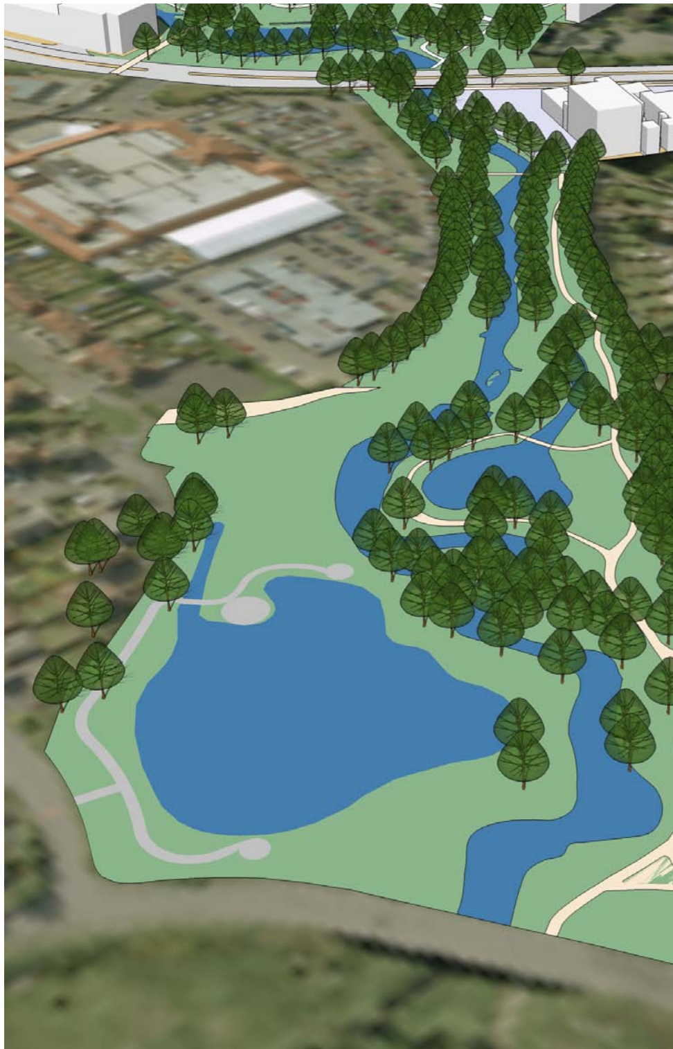
3d image of character area.