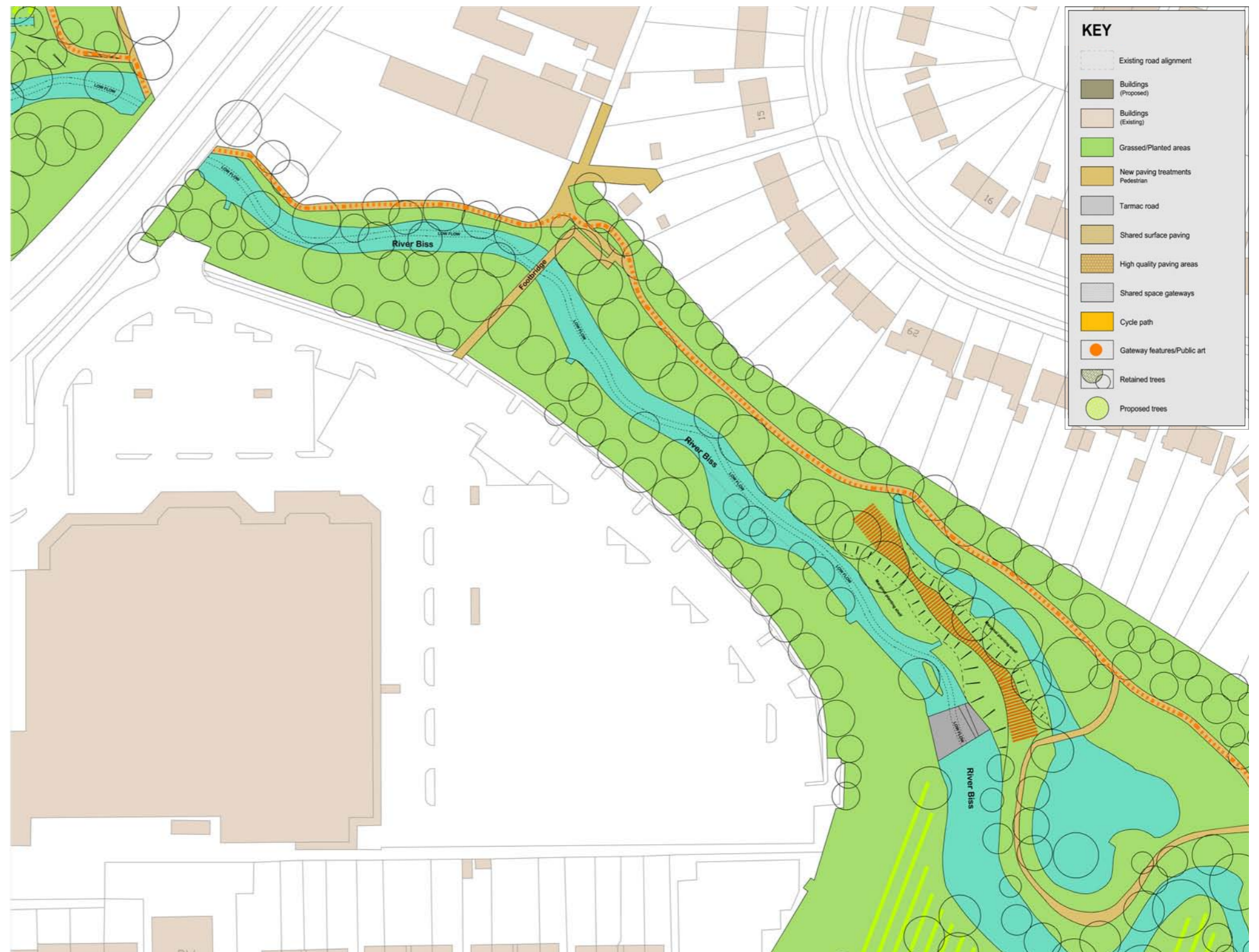
Figure 9.17: Biss Meadows illustrative public realm proposals.