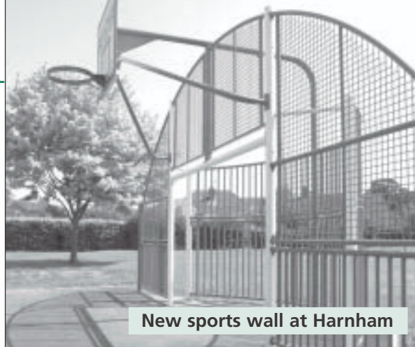
New sports wall at Harnham

affordable housing in the City by December 2007. Salisbury District Council to maintain the allocation up to 40% affordable housing in larger developments.