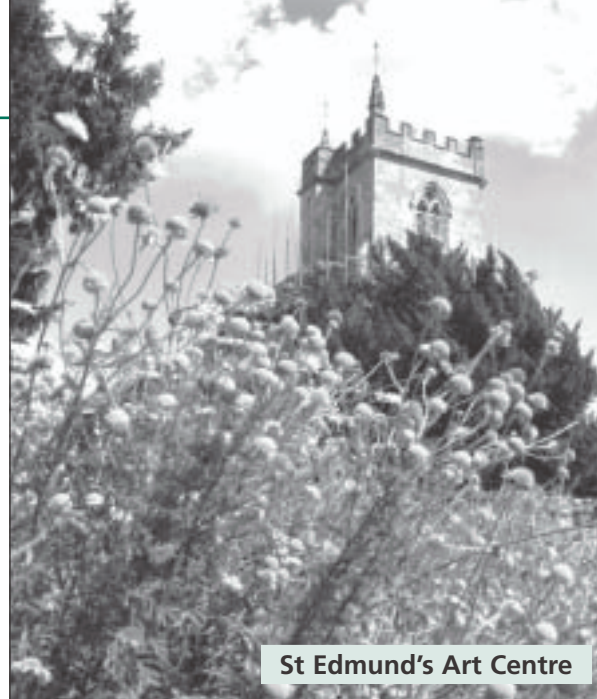
St Edmund's Art Centre

the ward to combat vandalism, such as the Kelsey Hill underpass project.