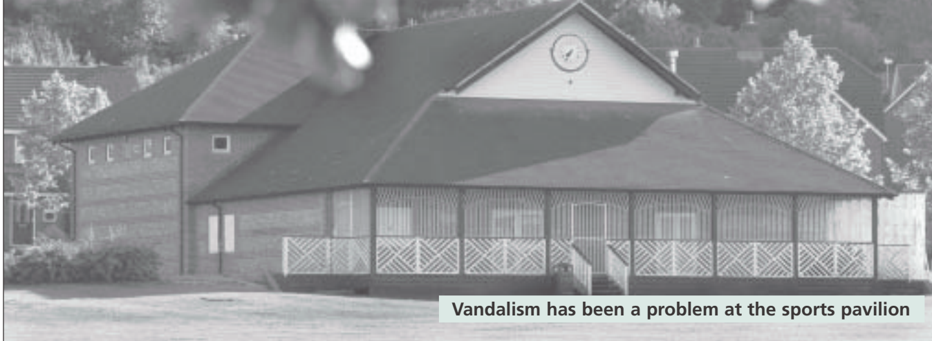
Vandalism has been a problem at the sports pavilion