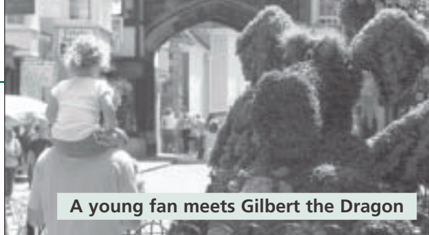
A young fan meets Gilbert the Dragon