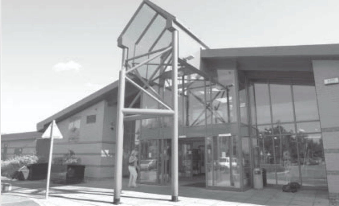
Five Rivers Leisure Centre and swimming pool