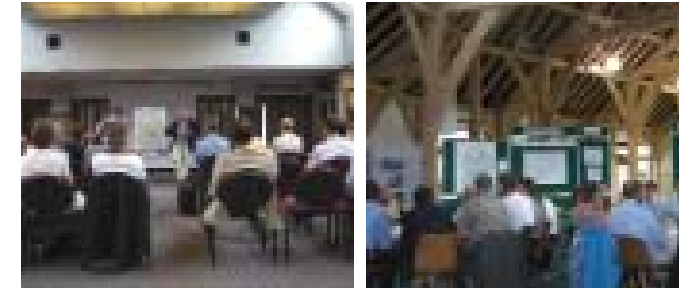
Examples of community engagement – Minerals Forum

Wiltshire County Council is committed to finding new ways of involving the community more effectively in the planning system. We seek to ensure that all people with an interest in planning at the County level understand how they can contribute to and influence the outcomes of the decision making process.