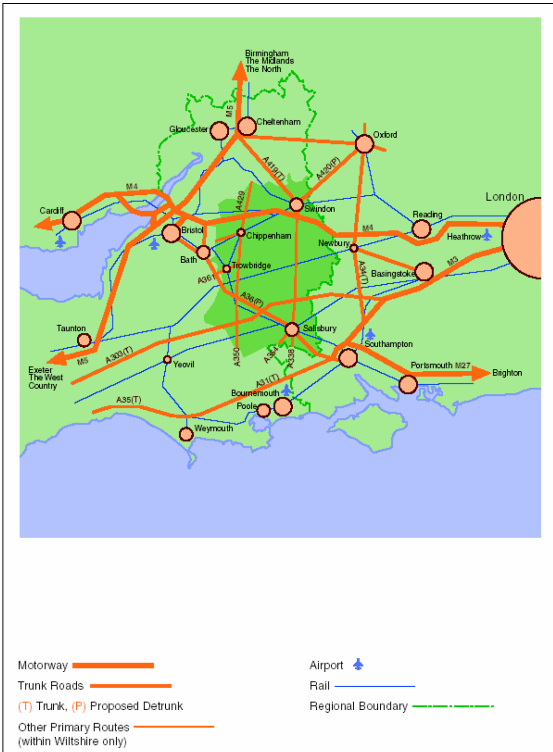
Figure 2.1 Regional Context