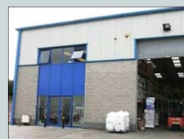
Photos: SIMS recycling state of the art WEEE recycling facility in Mississauga, Ontario, Canada WEEE recycling facility, Mallusk, Northern Ireland