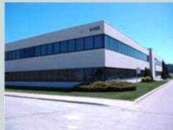
Photos: SIMS recycling state of the art WEEE recycling facility in Mississauga, Ontario, Canada WEEE recycling facility, Mallusk, Northern Ireland