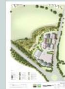
Photos: Lakeside Energy from Waste Facility; Bore Hill Landscape Master Plan