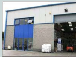
Photos: SIMS recycling state of the art WEEE recycling facility in Mississauga, Ontario, Canada WEEE recycling facility, Mallusk, Northern Ireland