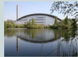
Photos: Lakeside Energy from Waste Facility; Bore Hill Landscape Master Plan