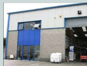
Photos: SIMS recycling state of the art WEEE recycling facility in Mississauga, Ontario, Canada WEEE recycling facility, Mullusk, Northern Ireland