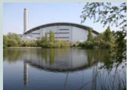
Photos: Lakeside Energy from Waste Facility; Bore Hill Landscape Master Plan