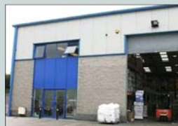
Photos: SIMS recycling state of the art WEEE recycling facility in Mississauga, Ontario, Canada WEEE recycling facility, Mallusk, Northern Ireland