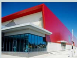
Photos: WTS, Bangor

A depot where waste is deposited, stored, bulked and then transferred in larger loads to another facility for recycling, treatment or disposal