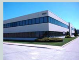
Photos: SIMS recycling state of the art WEEE recycling facility in Mississauga, Ontario, Canada (image courtesy of SIMS Recycling Solutions) WEEE recycling facility, Mallusk, Northern Ireland (image courtesy of AMI)

Collecting, storing and bulking particular waste materials prior to transfer (can also include metal recycling, car-depollution and Waste Electrical and Electronic Equipment (WEEE) facilities)