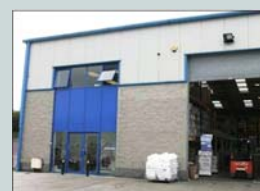
Photos: SIMS recycling state of the art WEEE recycling facility in Mississauga, Ontario, Canada (image courtesy of SIMS Recycling Solutions) WEEE recycling facility, Mallusk, Northern Ireland (image courtesy of AMI)