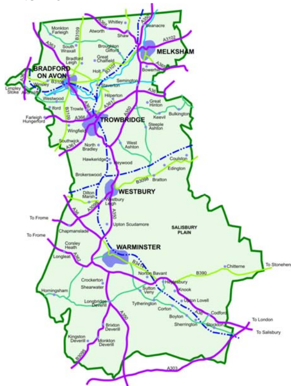
Figure 1: West Wiltshire

© Crown Copyright. All rights reserved West Wiltshire District Council 100022961 2007