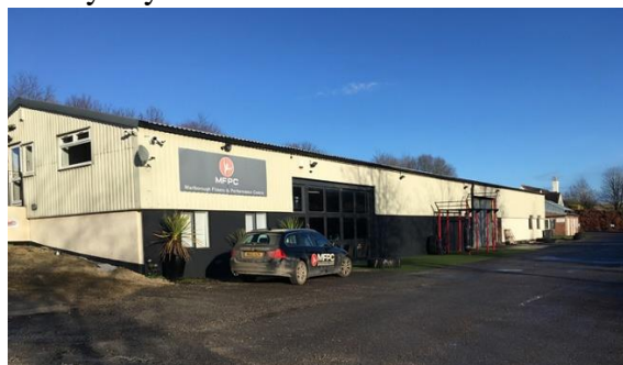
Fig 18: Existing light business use buildings at Elm Tree site on A4 Bath Rd

With a more sustainable lifestyle and providing local housing for local workers as objectives, the NP will support proposals for a small scale mixed use employment/affordable housing development at the site known as the Elm Tree Farm business area, on the A4 Bath Road at Clatford. This site is not on any skyline.