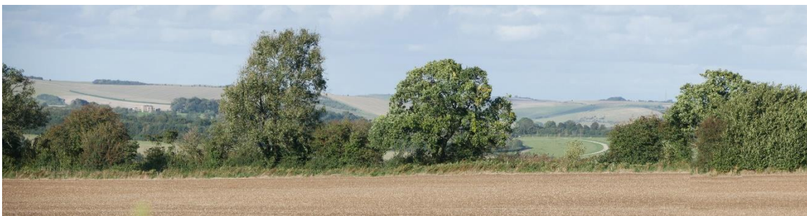
Fig 13: The need to protect open landscape and skylines was noted as important. This is the skyline from PRoW PRES32 north towards Barbury Castle

4.3 The largest number of responses were from retired residents, with good response from residents working in Preshute or working elsewhere. Land owners were also well represented. We had no responses from business owners living elsewhere or people working in Preshute but living elsewhere.