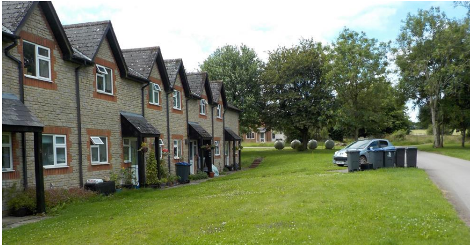
Fig 12: Homes on the Manton House Estate

4.1 For the initial community engagement, the Parish Council produced a leaflet describing the neighbourhood plan and a questionnaire. Hardcopies of these documents were distributed to each house and business in the parish in early March 2021. In addition, we identified and spoke to non-resident land owners and sent them the leaflet and questionnaire. Both leaflet and questionnaire were available online through the parish website, the latter allowing residents to respond online by PC or mobile.