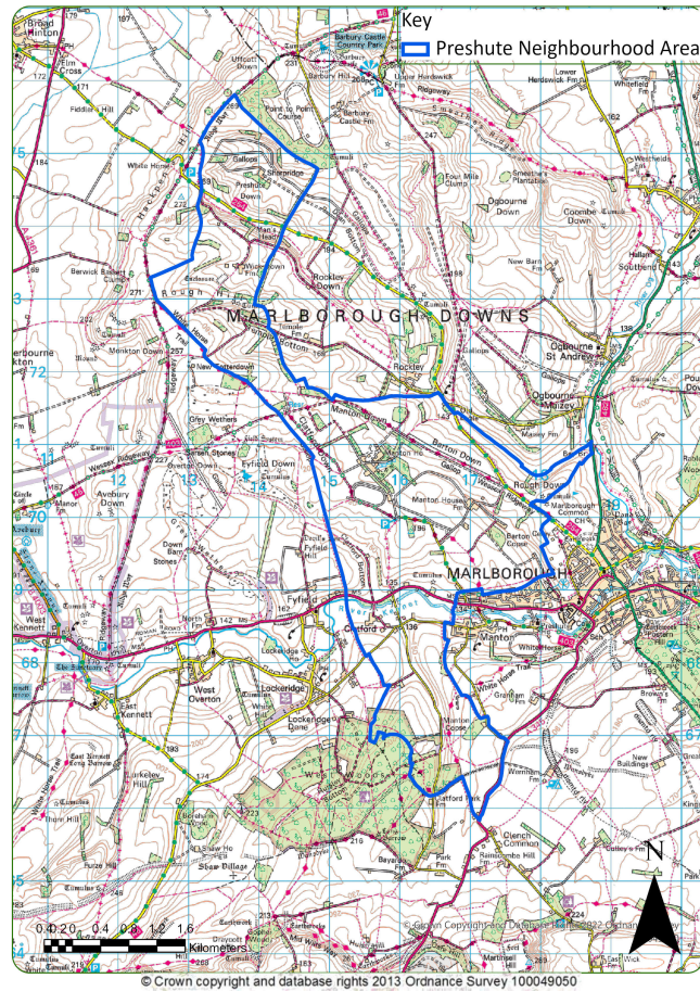
Fig 2: Preshute Neighbourhood Area Designation (Map 1)