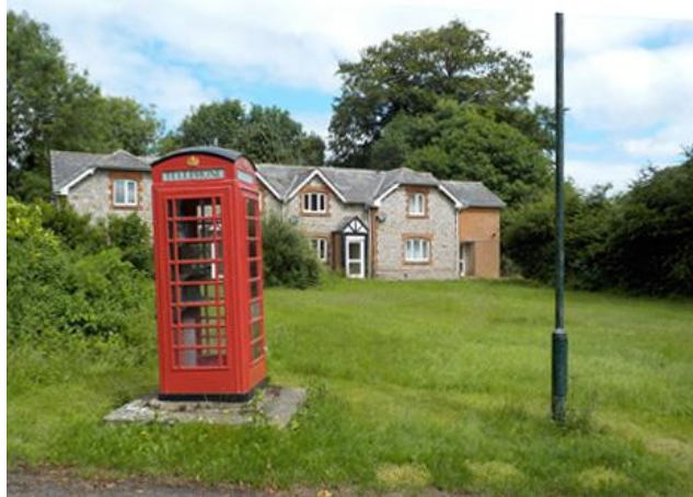
Fig 19: Cottages on the Manton House Estate

There has been a significant increase of walkers, cyclists and riders out from the local towns and villages during and subsequent to the Pandemic. These numbers are expected to be maintained and increase as tourists return. Preshute wants to ensure everybody enjoys the countryside, within the spirit of the NHS Healthy Placemaking initiative. It is an objective to facilitate legitimate public access, countryside code awareness and guiding visitors along the many Public Rights of Way, PROW (See Appendix 1, Maps 8, 9). It is an objective to foster tourism responsibly, ensuring the best interests of our residents, landowners and farmers are upheld.