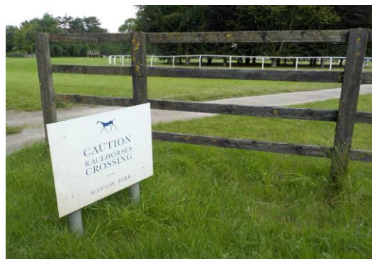
Fig 8: Preshute is a centre for world class equestrian training

3.2 There are three scattered hamlets: Clatford, the Manton House and Manton Park Estates (including two world class horse racing yards and an equestrian centre) and the Temple Farm Estate. There is a small employment area on the A4 and additionally, other small businesses and tourist accommodation elsewhere in bed and breakfast and holiday rental type establishments.