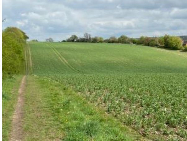
Fig 15: Skyline to south east from PRES32 towards Barton Dene

The community engagement preceding the drafting of this Neighbourhood Plan overwhelmingly endorsed the outstanding landscape quality. The whole area lays within the North Wessex Downs AONB and contains elevated downland and the valley of the River Kennet. Preshute is unique in that it contains a rich kaleidoscope of heritage, landscape, biodiversity, river and unique archaeological assets. It is adjacent to the Avebury World Heritage Area and is widely considered as the source of Stonehenge's mighty sarsen stones. There are long distance ancient pathways of national importance offering panoramic views of open landscape and skylines across the parish and beyond.