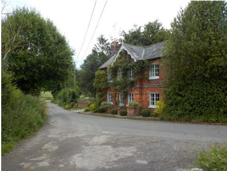
Fig 17: Housing at Clatford