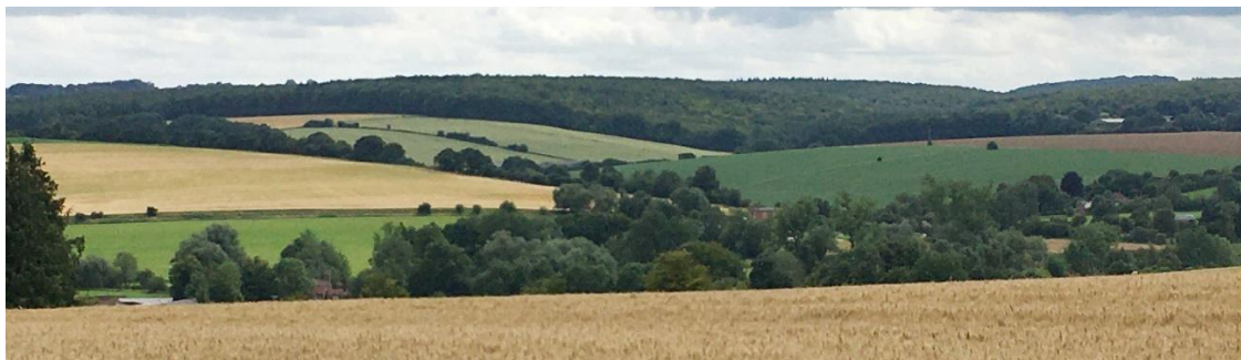
Fig 3: West Woods from Downs Lane, with A4 Bath Road in foreground

2.1.1 Preshute is a rural parish adjacent to Marlborough and lays entirely within the North Wessex Downs Area of Outstanding Natural Beauty (AONB). Bisected by the River Kennet and the A4 Bath Road, Preshute's southern border takes in the unmatched Wansdyke and West Woods (now identified as the source of Stonehenge's mighty sarsen stones), while to the west is the World Heritage Area of Avebury.