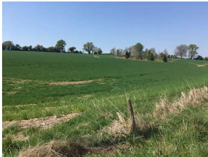
Fig 9: Rolling arable downland at Barton Dene

3.7 Preshute is an important Parish forming part of the landscape setting for the market town of Marlborough in the east and the Avebury World Heritage Area in the west.