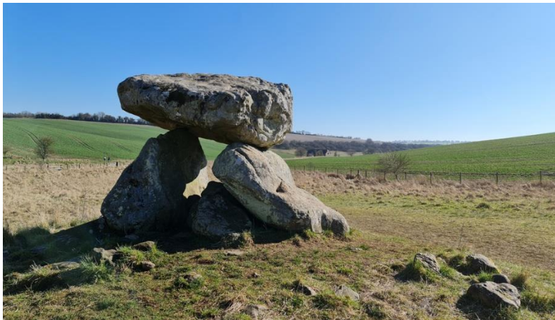
Fig 1: The Devil's Den historic monument

1.2 The Wiltshire Core Strategy sets out strategic planning policies for the period 2006-2026. This plan is being reviewed by Wiltshire Council and the strategic policies will be ‘rolled forward’ to cover the period 2016-2036 and a draft plan is expected to be published in the third quarter of 2023 for consultation. The revised Strategic Plan will be called the Wiltshire Local Plan. The Preshute NP has been prepared in parallel with the Wiltshire Local Plan.