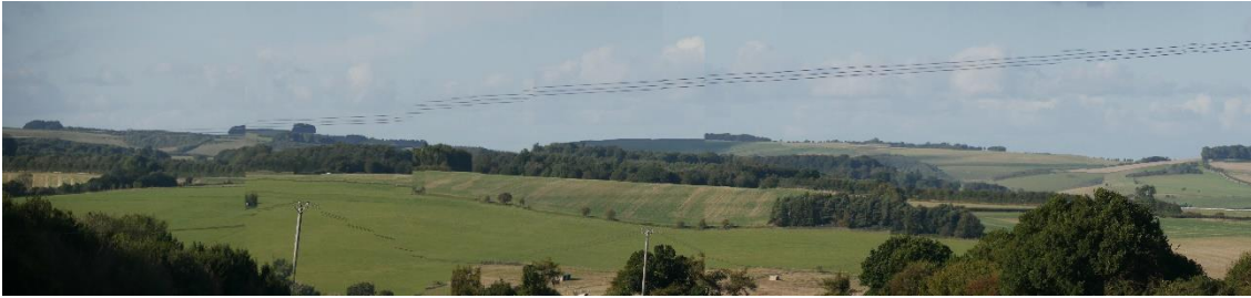
Fig 20: Skyline from Manton Drove west towards Fyfield Down and the Ridgeway

In particular the Working Group and Parish Council are keen to mark the Covid-19 pandemic by planting 200 trees. This would represent one tree for every member of the community to mark this once-in-a-lifetime event, as a memorial to all those who have been affected by the pandemic and to celebrate the work of everyone who helped to address its consequences in so many ways. These groups of trees and avenues will be marked by small plaques describing them as Covid Copses and recognising the generosity of owners in making the land available. Inter-woven with the proposals presented below is a philosophy that encourages and supports biodiversity enhancement with proposals such as additional tree planting and environmental improvements along the river valley.