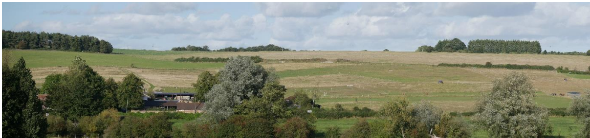
Fig 21: Skyline from Manton to Clatford Road north towards White Horse Trail (PRES27) on skyline