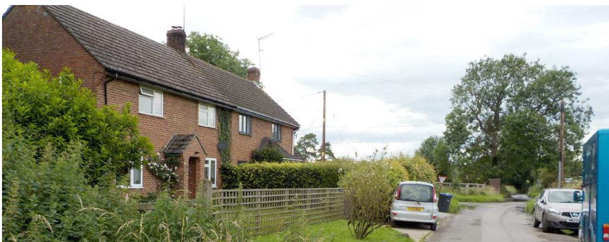
Fig 11: Clatford cottages

3.13 Preshute has become an important area for active tourism use with many walkers, cyclists and horse riders taking advantage of the numerous paths and bridleways through the open countryside, the Kennet valley and the woodlands at West Woods – the area believed to be the source of the sarsen stones used at Stonehenge. In addition to visitors from far afield the area is also extensively used by residents of Marlborough and nearby towns for exercise and recreation. The increase in visitor numbers is to be welcomed. The increased visitor numbers give rise to the need to facilitate this usage, improve footpath signage and maintenance, information signage, parking and tourist accommodation and facilities.