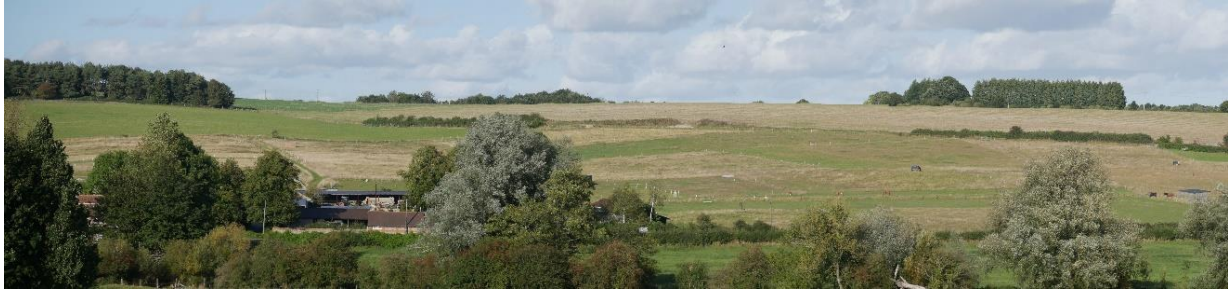
Fig 16: Skyline from Manton to Clatford Road north towards White Horse Trail (PRES27) on skyline

There are other lower lying areas of visual importance from important viewpoints e.g. along the Kennet Valley and at Barton Dene.