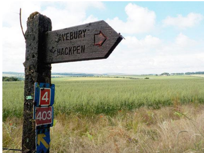
Fig 4: Preshute lays within a treasured part of the Wiltshire countryside

2.2.2 In the 13th Century the parish appears to have been divided into Elcot tithing (largely to the east of Marlborough) and the King's Tithing. The hamlets of Clatford and Manton and probably the church, were included into the western Preshute parish. The parish also included two areas of surrounding downland - one owned by the Crown and the other by the Templars were added as well as the area now known as Marlborough Common. The first mention of Clatford Manor appears to be 1066, when it was owned by a gentleman called Alwin. The estate passed to the Mortimer family and in the 12th, Century became a small priory. Over the coming hundreds of years, the manor and its surrounding farmland changed hands many times. In 1923, Clatford farm was sold to J.B. Wroth. The farm was sold again in 1978 and today, two members of the Wroth family still serve as Councillors on Preshute PC.