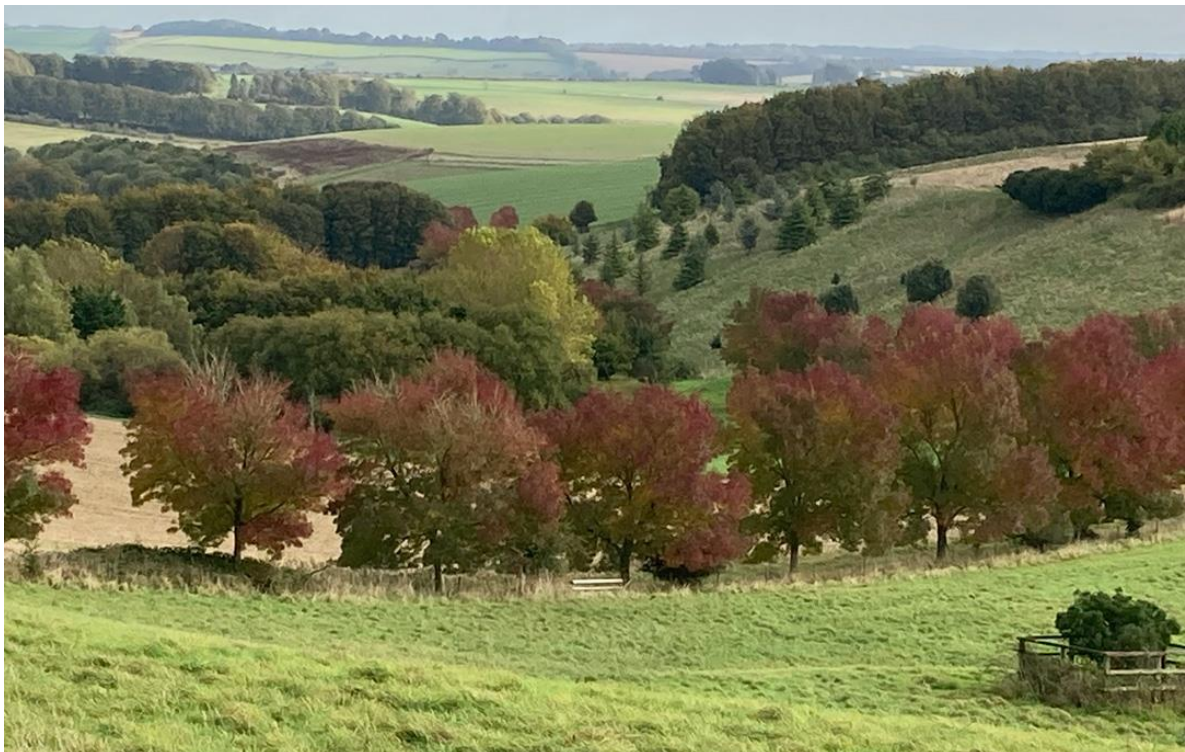
Fig 14: Historic landscape viewed from the Ridgeway towards Temple Farm, with the medieval era Wick Farm to the left

A few residents suggested we could consider whether it was possible to facilitate a very small number of cheaper houses for local people.