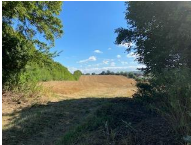
Fig 10: Looking East from the White Horse Trail towards Barton Dene over farmland north of Barton Park houses

3.11 The Marlborough Settlement Boundary forms a clear and recognisable urban fence and marks the boundary between urban and rural characteristics.