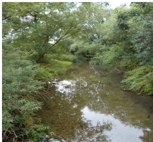
Fig 6: The chalk stream Kennet runs through the parish

2.2.6 From a geological viewpoint, most of Preshute is on the chalk of the Manton and Fyfield Downs, and was included as a key area within the North Wessex AONB in 1972 as one of the first areas to be designated as an AONB. The parish is criss-crossed by many ancient public Rights of Way. From the sarsen littered downs at Fyfield (near the Devil's Den), the unique environment of the chalk stream River Kennet and the tranquillity of West Woods, Preshute is surely one of the most beautiful parishes in Wiltshire.