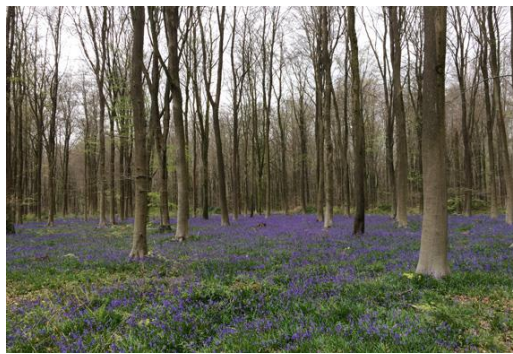
Fig 5: West Woods in the south of the parish is a nationally important area and now recognised as the source of Stonehenge's mighty sarsens

2.2.5 Preshute historically has been a prosperous community and in 1334 was taxed fourth highest of the 10 parishes making up the Selkley Hundred. In 1377, it is recorded that there were some 139 poll-tax payers. By 1871, Preshute Without counted 1,374 souls - largely because of the growth of the Manton House racing stables and Marlborough College. Boundary revisions reduced that number to 615 by 1931, reducing again after Manton was absorbed into Marlborough in 1934. By the 2011 Census, the population was shown as 192, but has experienced growth since.