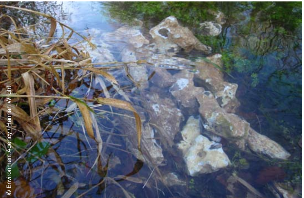
Large flint piles provide shelter for crayfish and trout

It is important to note that any in-channel or bankside works will require consent from your local Environment Agency office, and you should contact your local Natural England office to check that the site is not subject to special designation. Advice can also be sought from the Wild Trout Trust. Consultation with these organisations from the outset is strongly advised.