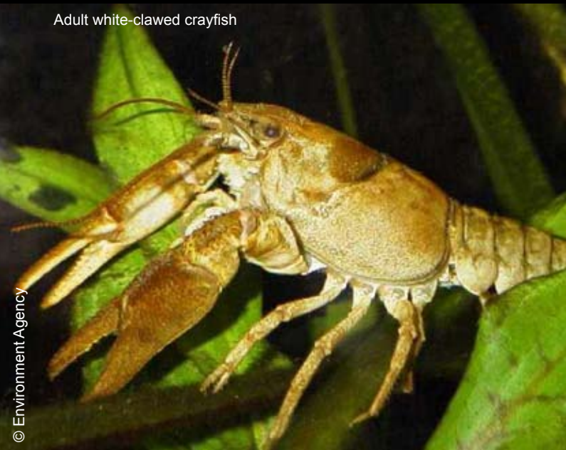
Adult white-clawed crayfish

Diet: Omnivorous – feeding on macroinvertebrates, carrion, calcified plants and detritus.