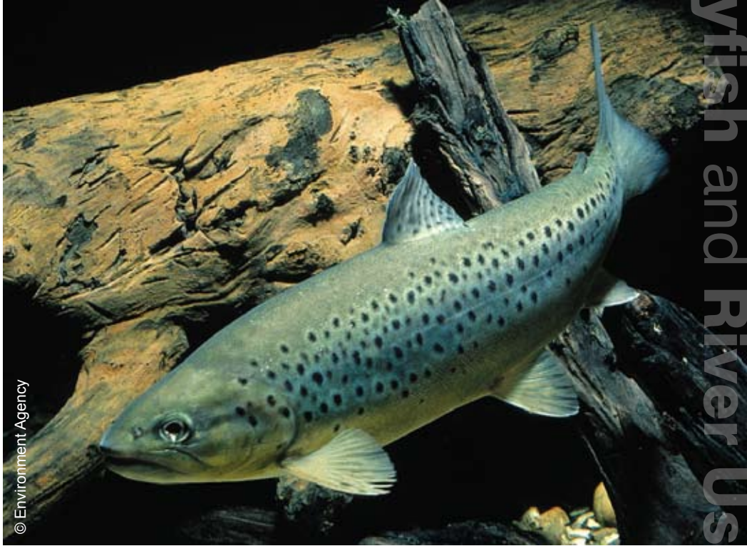
Adult brown trout