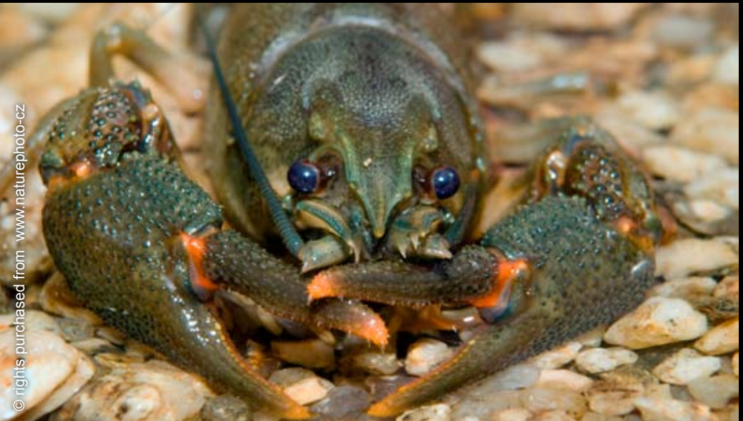
Adult noble crayfish Astacus astacus in aquarium

If you have any concerns about the keeping or selling of non-native crayfish please contact The Fish Health Inspectorate on 01305 206673 or email fish.health.inspectorate@cefas.co.uk (in strict confidence).