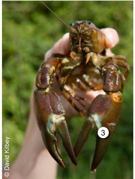
Underside and front view of an adult signal crayfish