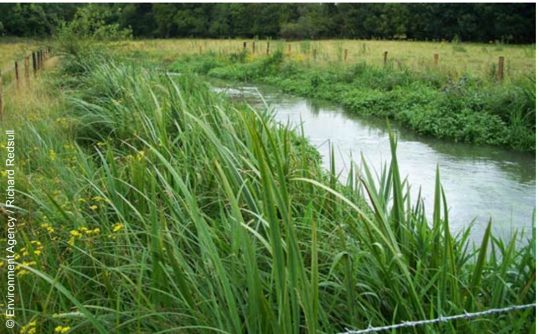
Bankside and marginal habitat enhancement using temporary fencing to allow the vegetation to establish

It is important to note that any bankside works will require consent from your local Environment Agency office, and consultation with the Environment Agency from the outset is also strongly advised.