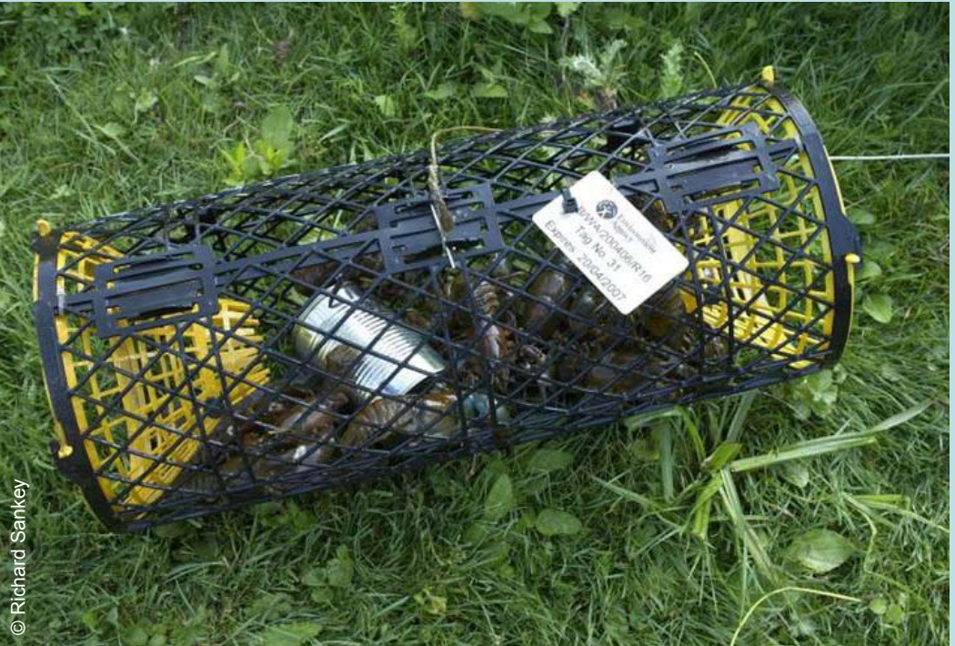
A licensed crayfish trap with catch of adult signal crayfish

If you have any concerns about the keeping or selling of non-native crayfish please contact The Fish Health Inspectorate CEFAS on 01305 206673 or email fish.health.inspectorate@cefas.co.uk (in strict confidence).