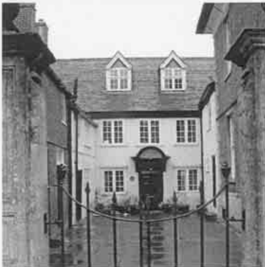
Courtyard group - Northgate Street