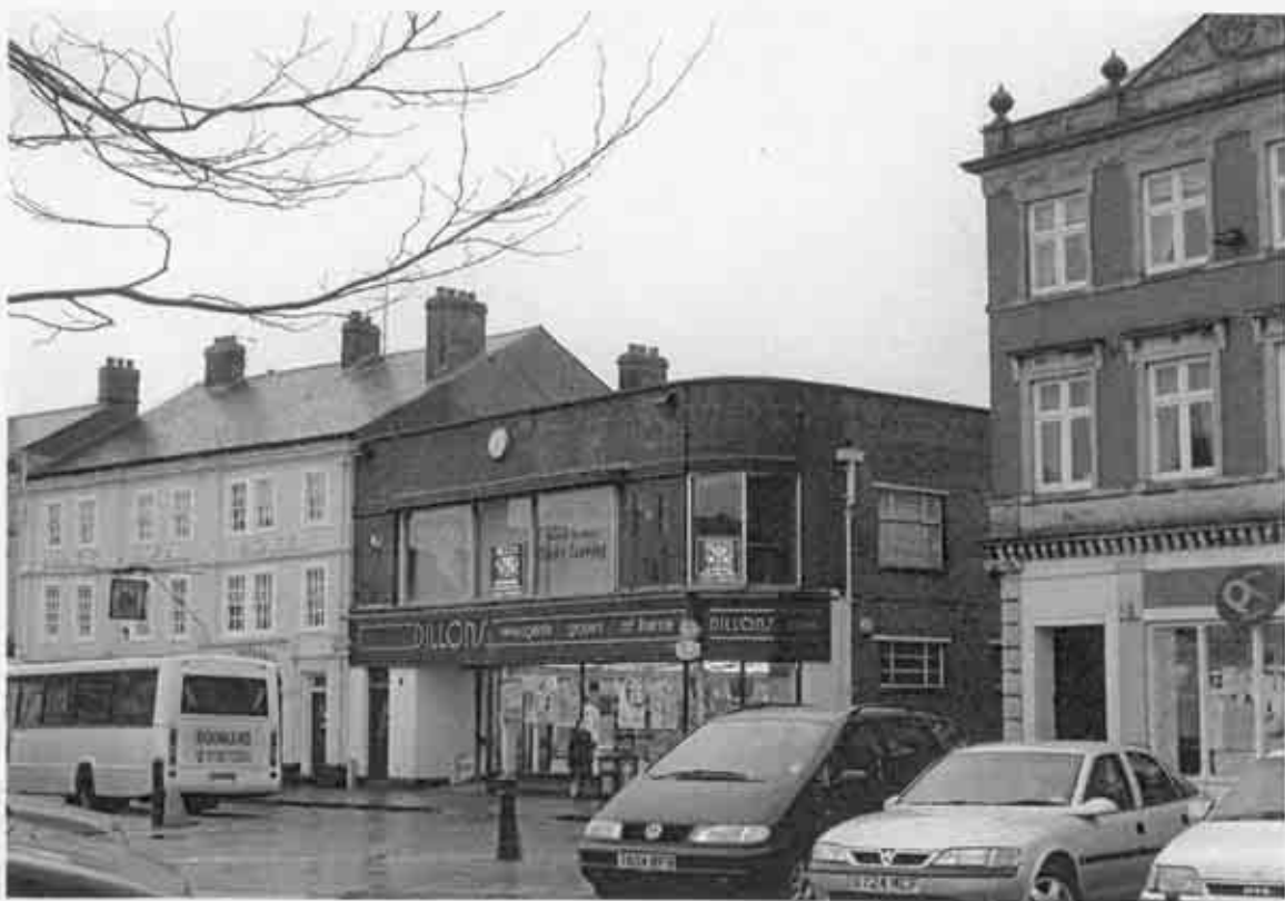
Devizes Market Place - current view as existing