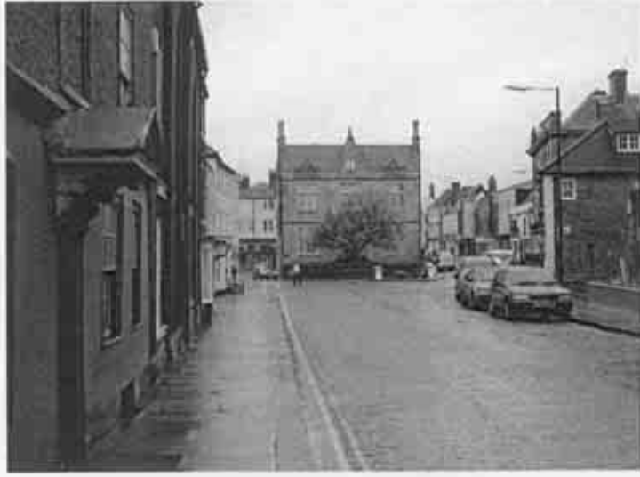
Example of end stop / landmark building