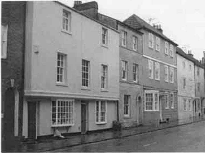
Varied building frontages - Long Street