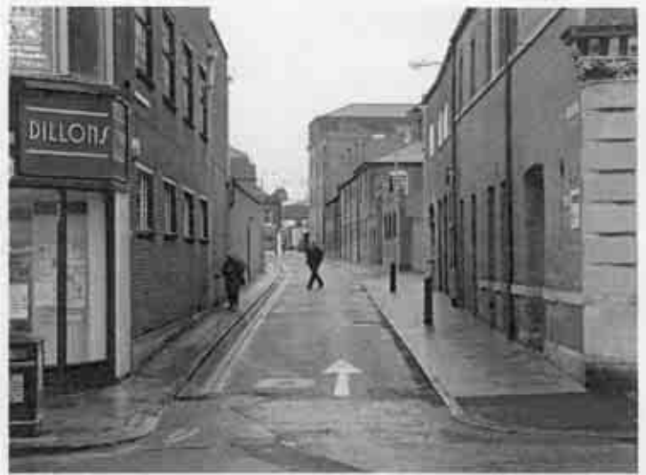
Snuff Street - south end