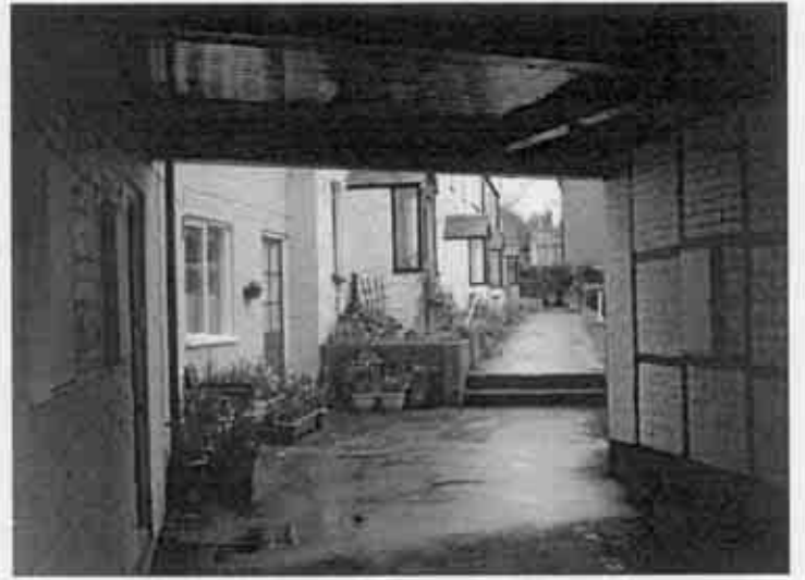
Typical archway entrance to residential court - Bridewell Street