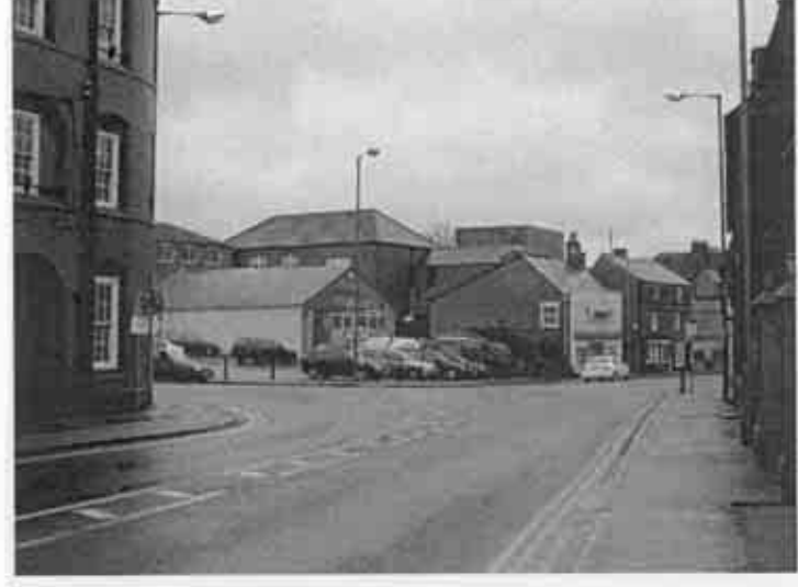
Gaiger corner - existing view