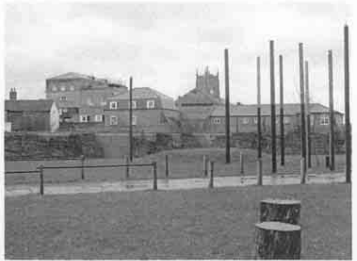
Central view of Site