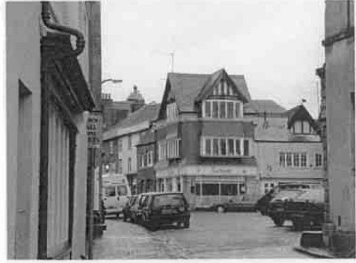
Example of landmark corner