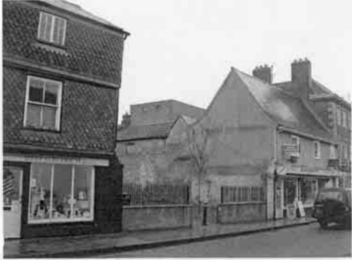
Gap in existing frontage on Northgate Street