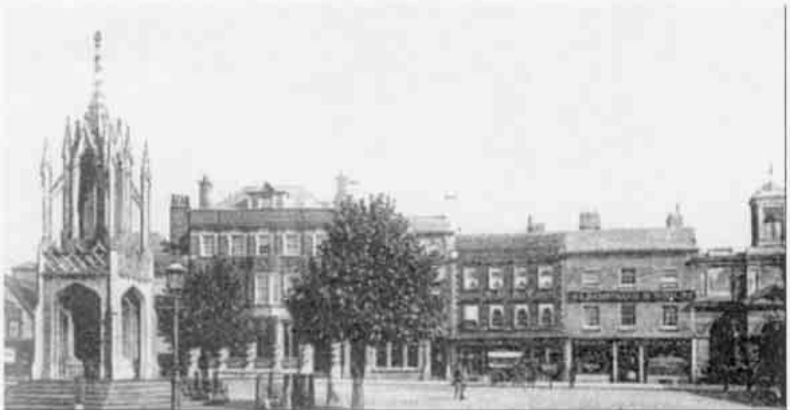
Market Place - historical view

2.18 The principle archaeological resource is understood to be the line of the former outer bailey defences which are projected to run through the southern part of the site in a concentric semi-elliptical pattern. While additional evaluation will need to be undertaken prior to development, bearing in mind the history of development on the site it is not anticipated that the archaeological resource will preclude development on any part of it.