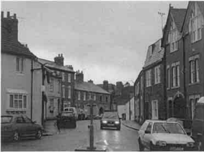
Building frontages - Bridewell Street