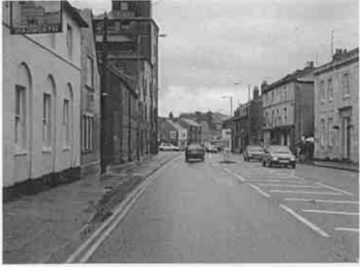
Distant view along Northgate Street - need for corner landmark