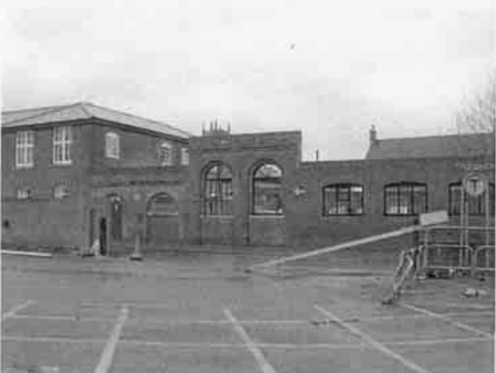
Former Tobacco Building