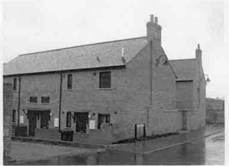
Recent residential group - Scotton Place