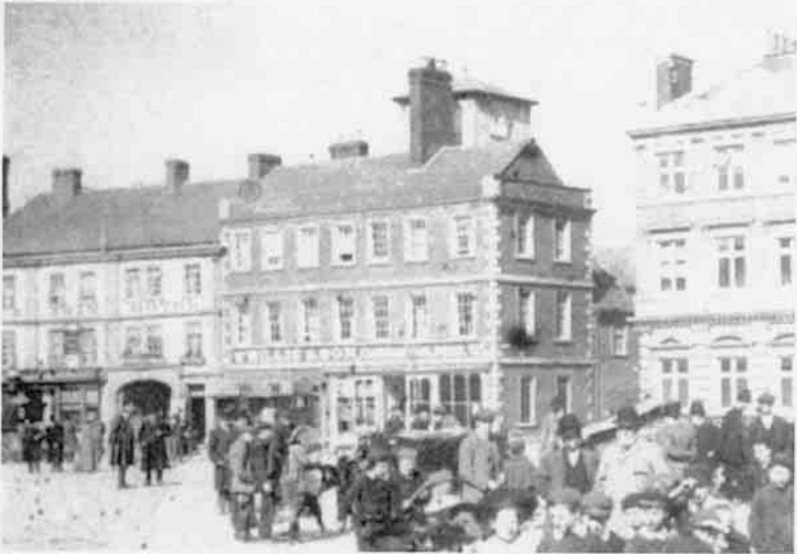
Devizes Market Place around 1900 - the former building which occupied the Dillons site is in the centre