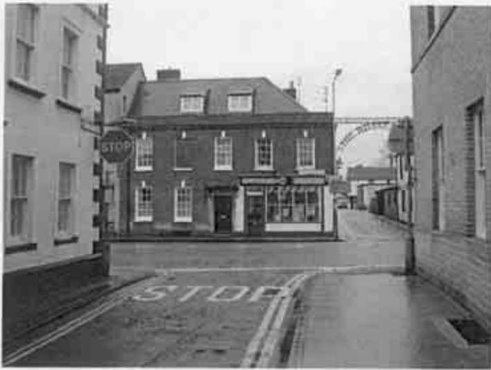
Snuff Street - north end