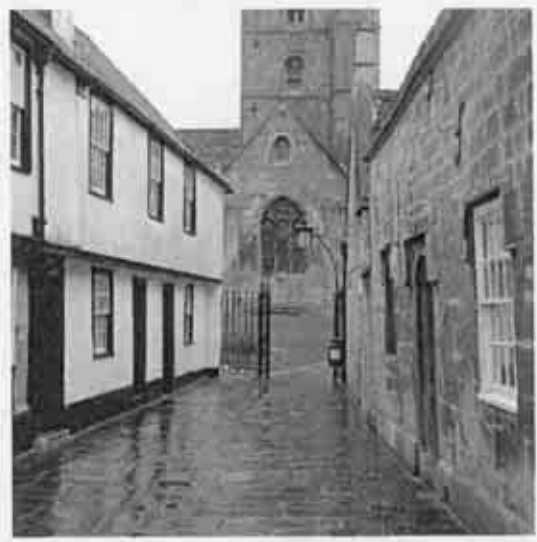
Example of narrowing vista - St John's Church