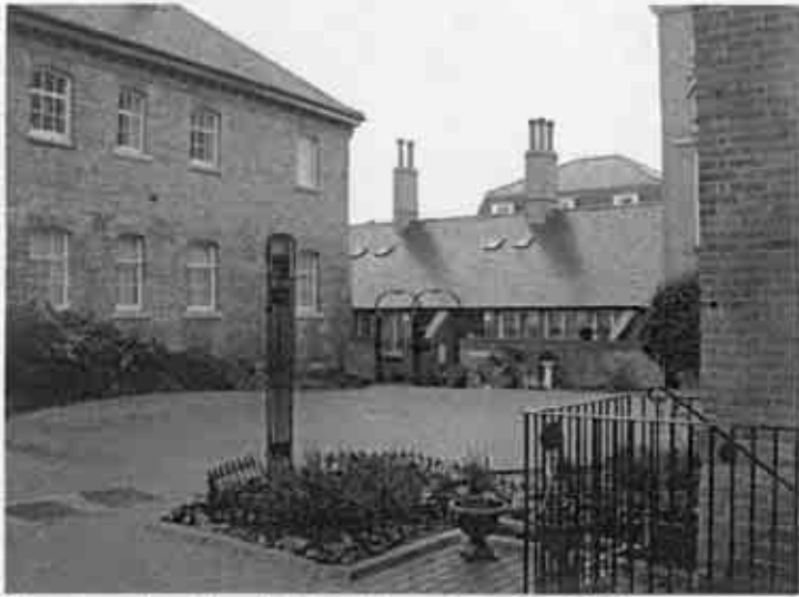
Courtyard residential development - Snuff Court