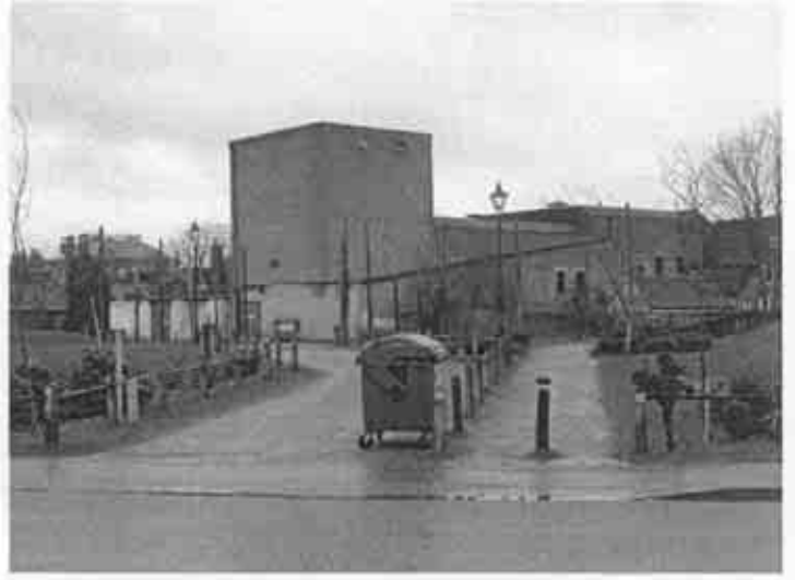
Rear of Cinema