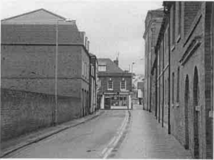
The Cottages / Nag's Head Court