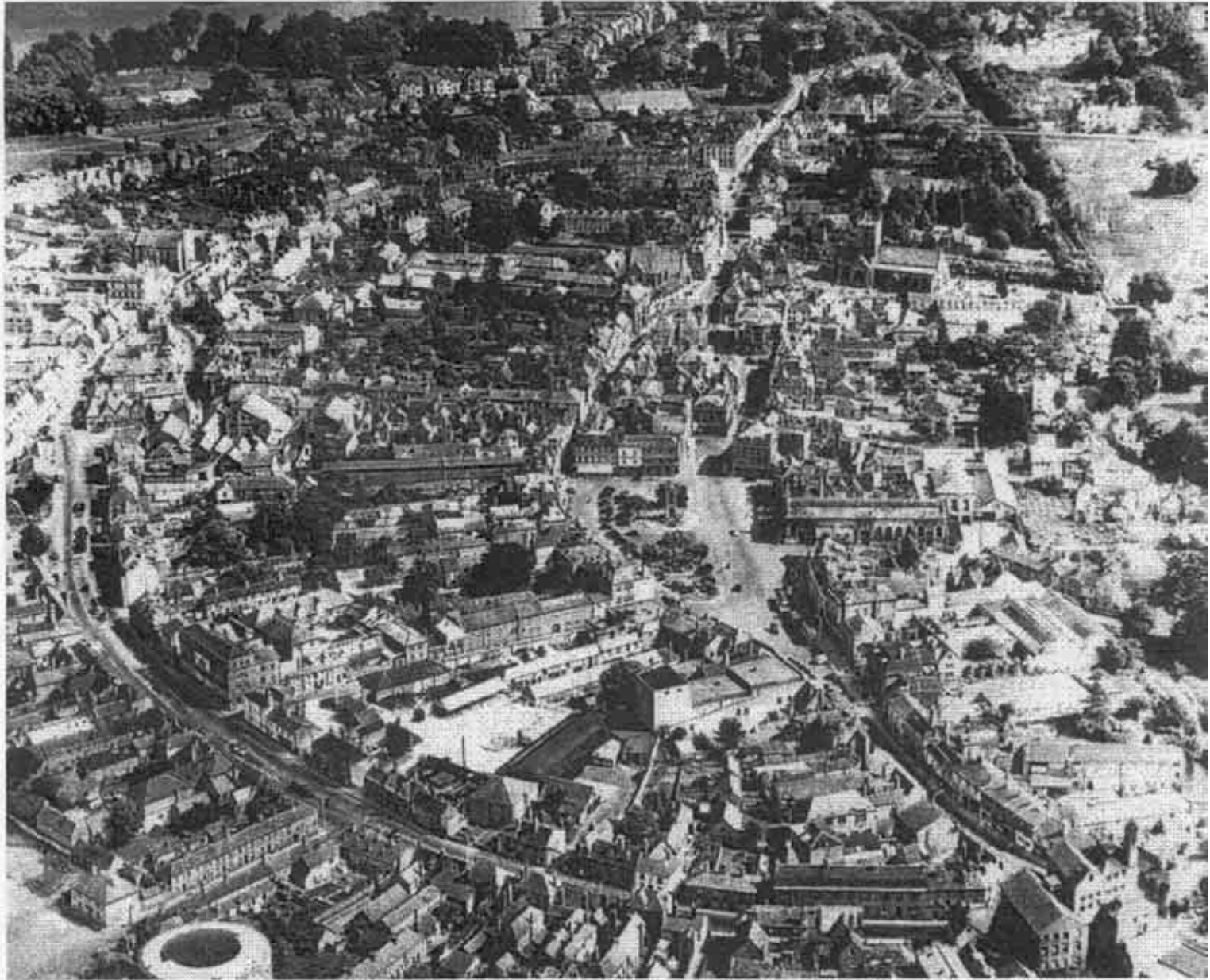
Devizes Aerial View 1949 - The site is in the foreground