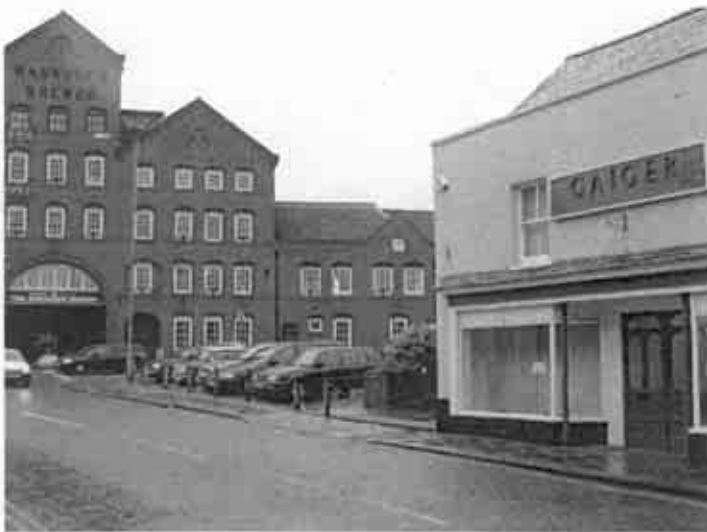
Wadworth / Gaiger Corner