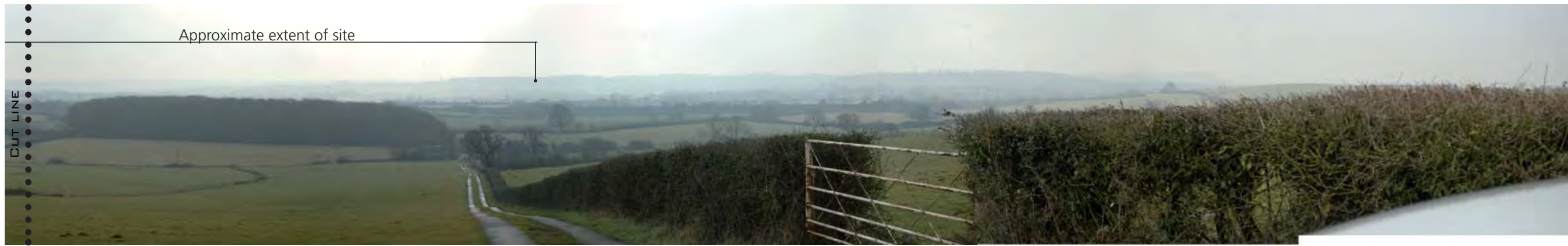
View looking south-east from track off B4042