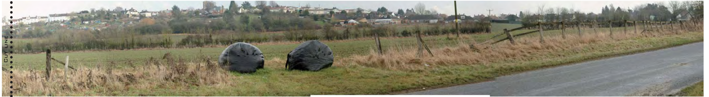
View looking east from Whitehall Lane towards Wootton Bassett.