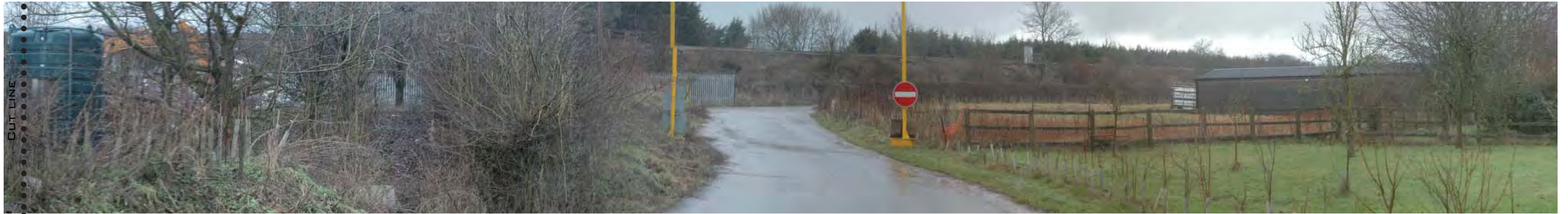
View from the access track on the eastern boundary of the site looking west towards the site.