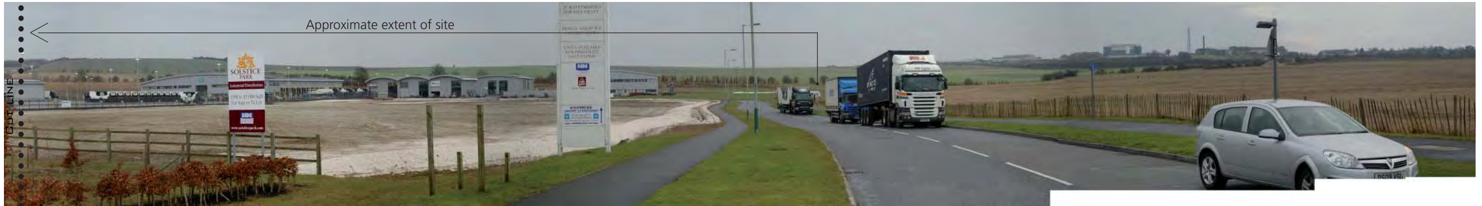
View looking east towards the Solstice Business Park site.