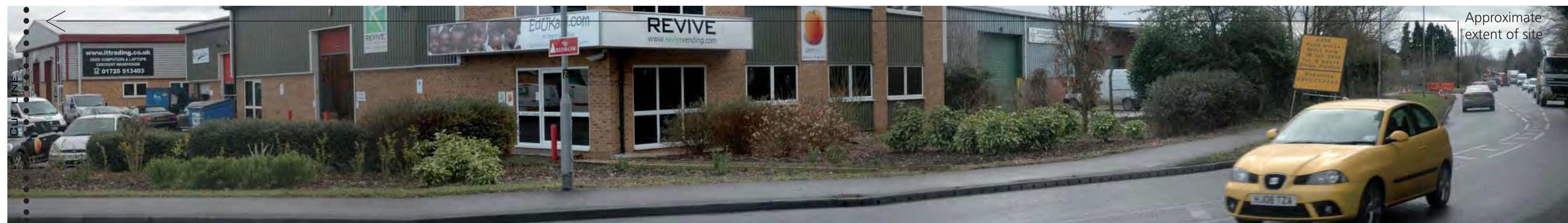
View looking east into the site from the A338.