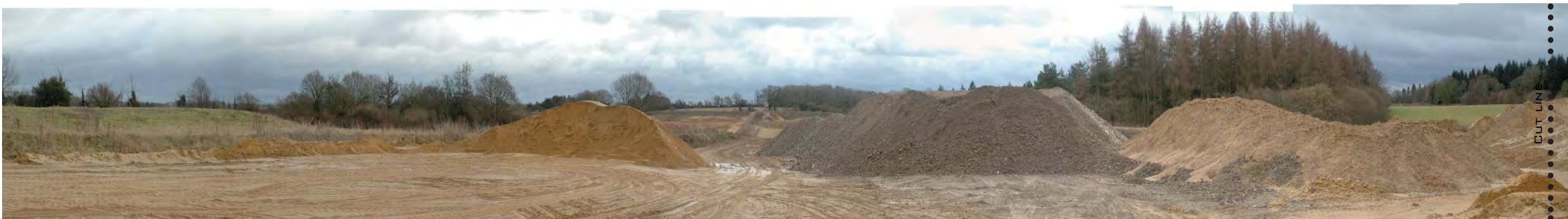
View from within the site compound looking north west along the main site entrance through to south west, parallel to the A36 highway.