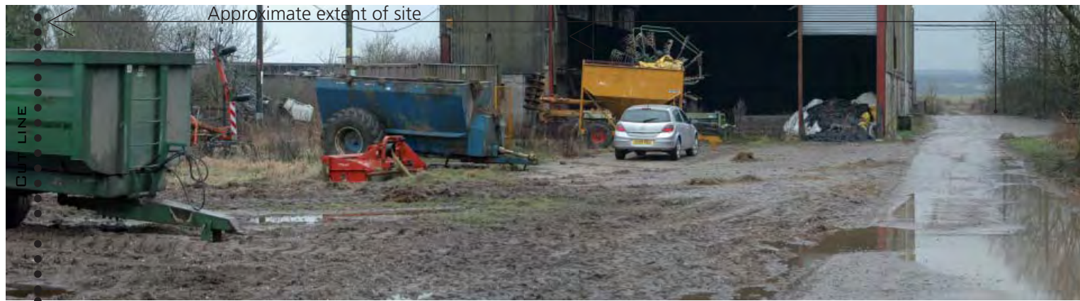
View looking north from the public footpath running adjacent to the site.