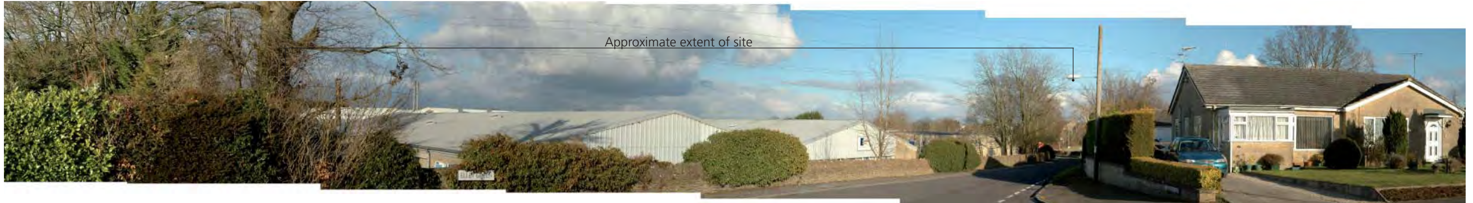
View looking north into site from Fleetwood Close.