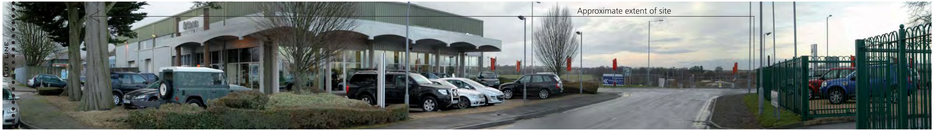
View looking south west along Danebury Court running through the centre of the site.