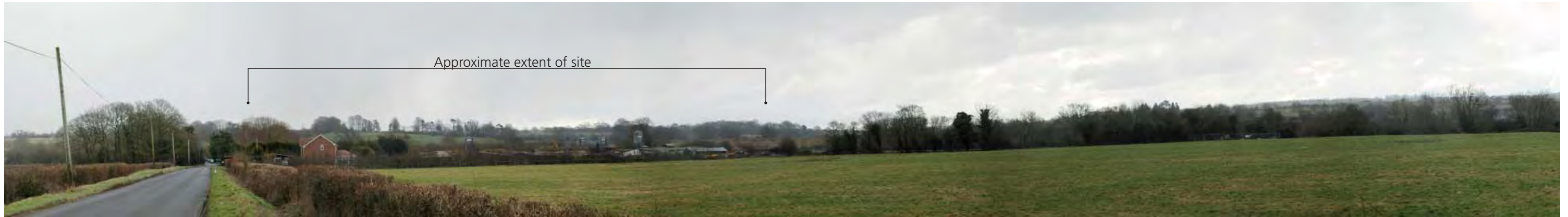
View looking south-east towards site from Broadway Road