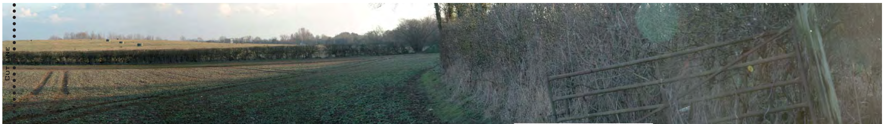
180 degree view of site from north-western corner.