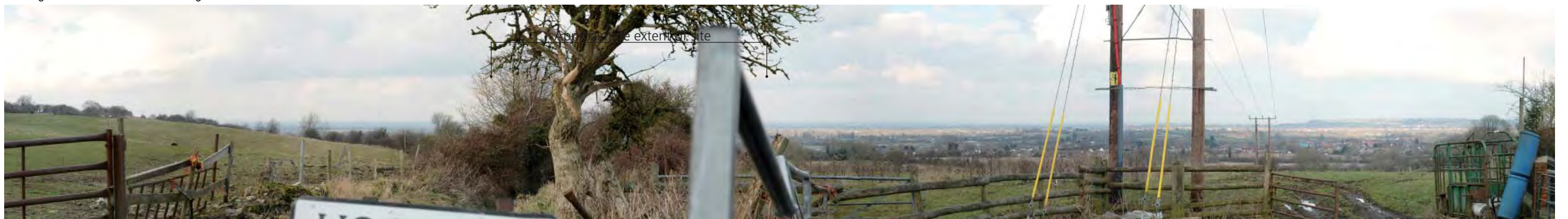
View looking north towards site from Upper Pavenhill road, Purton.