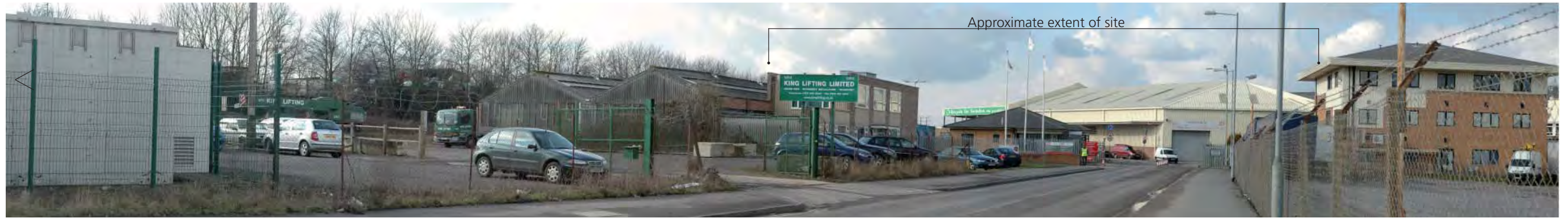
View looking north-west towards site entrance from Darby Close