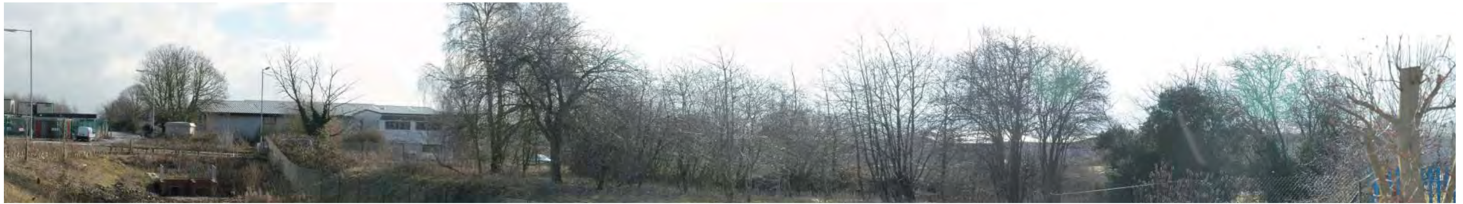
View looking south-east from inside of the site.