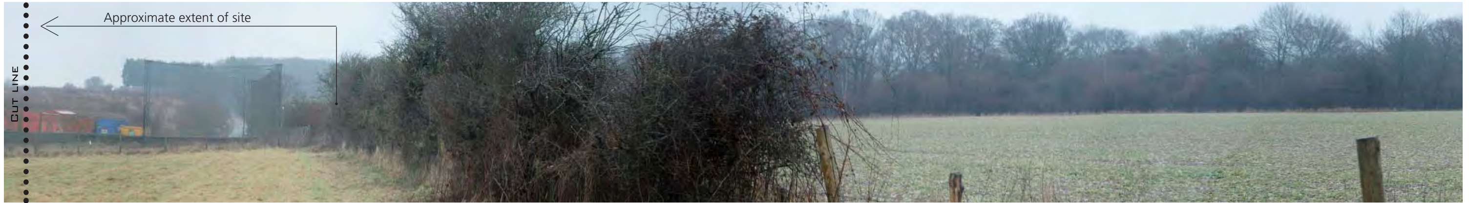
View from the adjacent public footpath looking north west into the site.