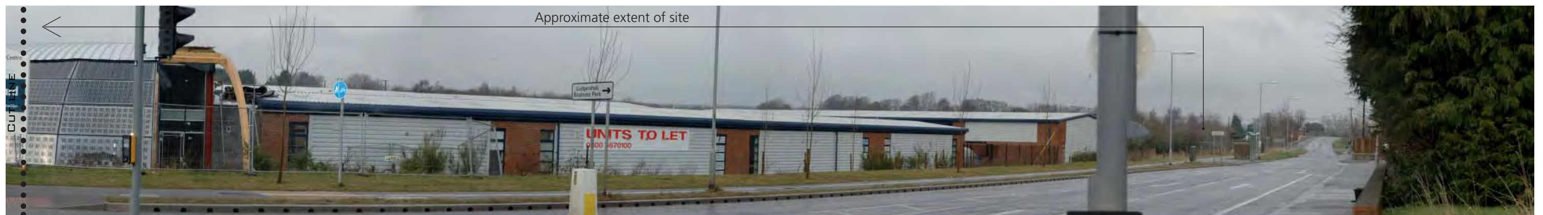
View from the A3026 adjacent to the main site entrance looking north into the site.