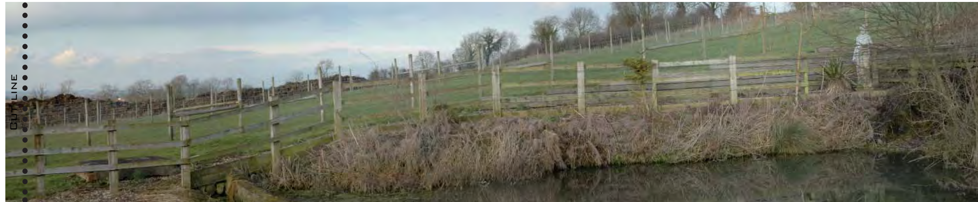
View looking north towards the site from Grove Farm.