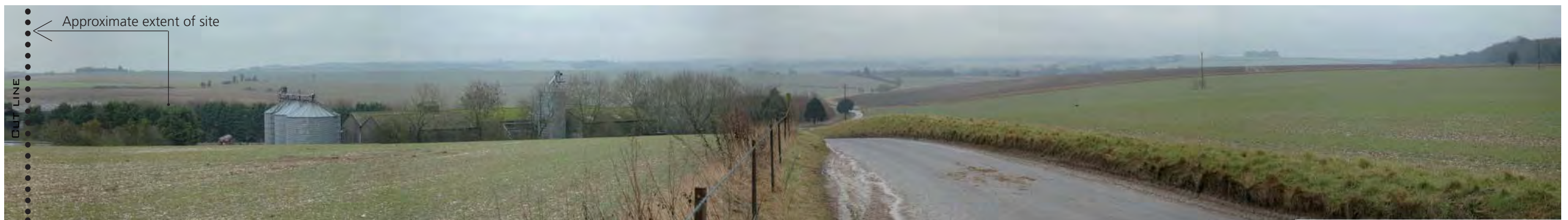
View looking north east from Everleigh Road toward the site.