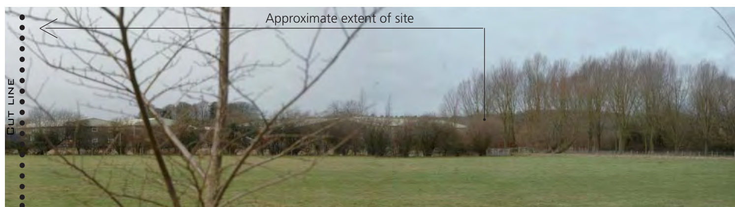
View toward the site from the public footpath and nearby residential properties to the east.