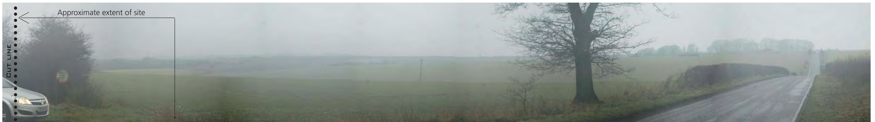
View looking south east from Everleigh Road toward the main site entrance.