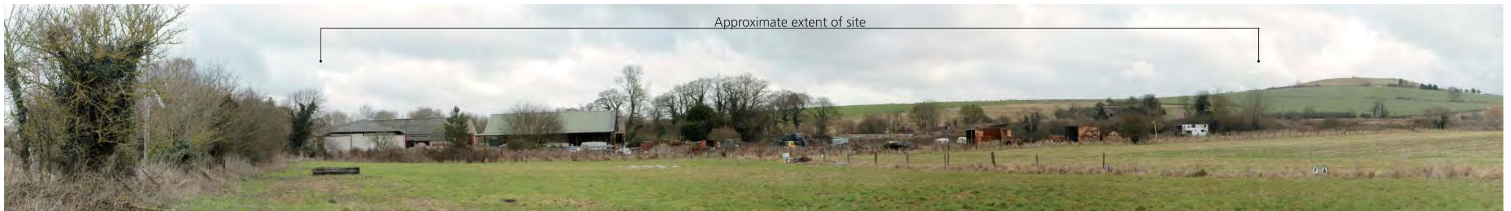
View looking east towards site from Sleight Lane