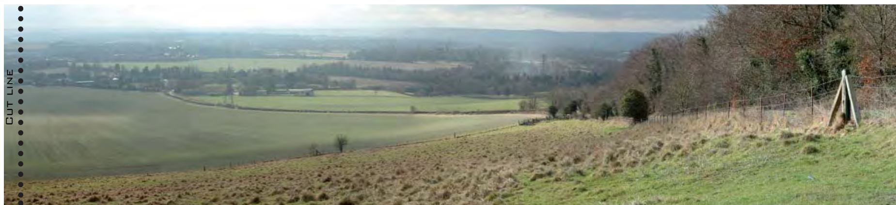
View looking south towards site from White Horse Hill Figure on Roundway Hill.