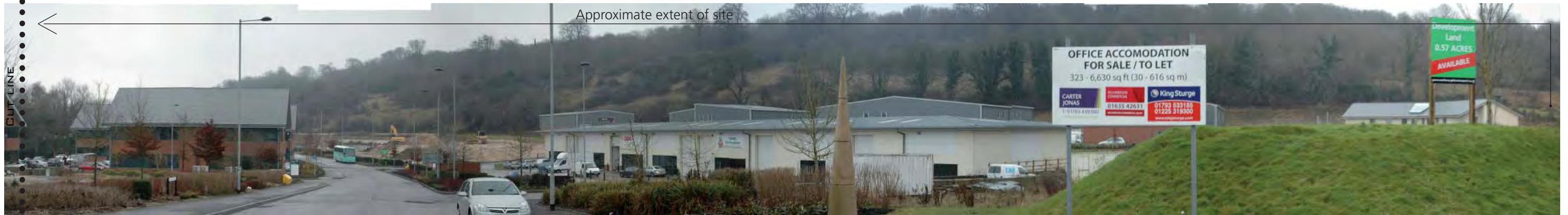
View from the site entrance at the A346 looking east into the site.