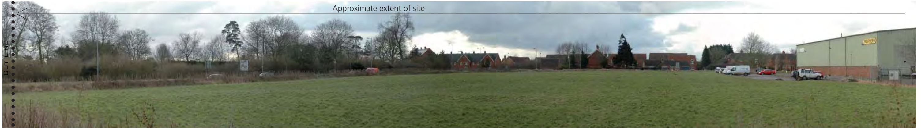
View from Alan Cobham Road looking west into site.