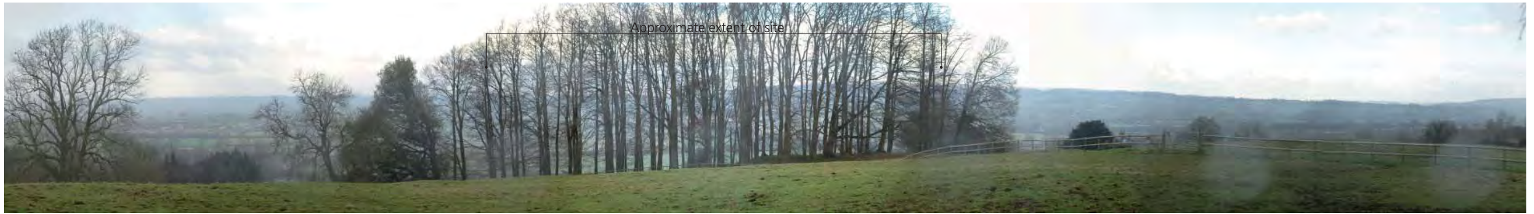
View looking north towards site from Pelch Lane.