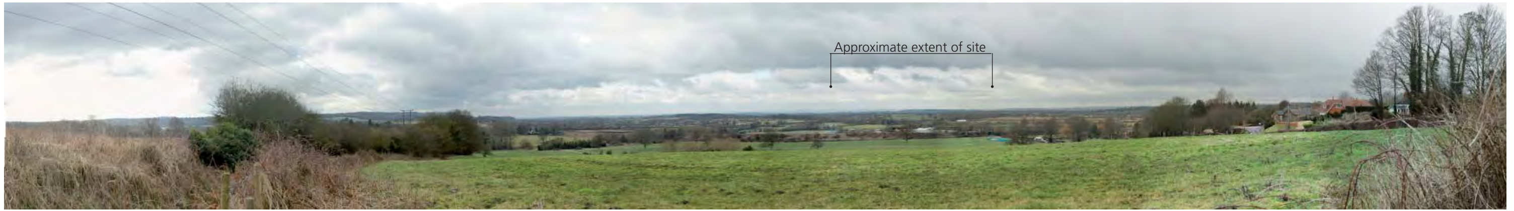
View looking north-west towards site from local country land on higher ground.