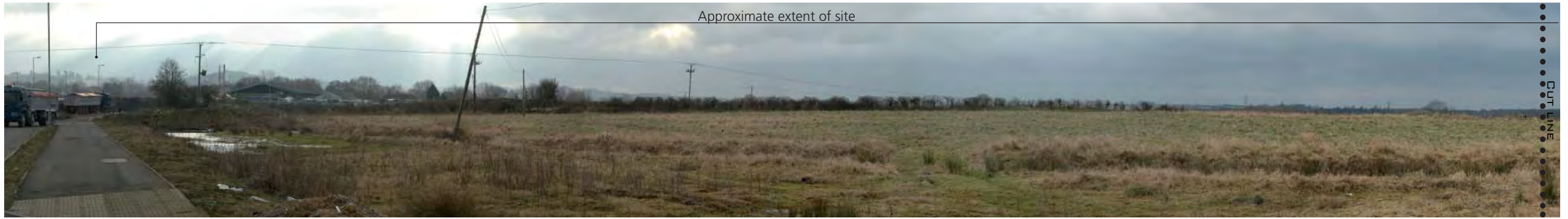
Approximate extent of site