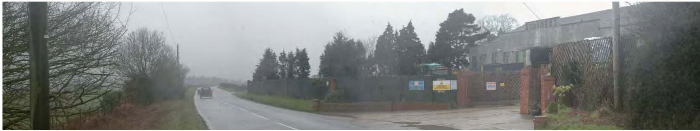
View from the A30 looking west through to north into the site.