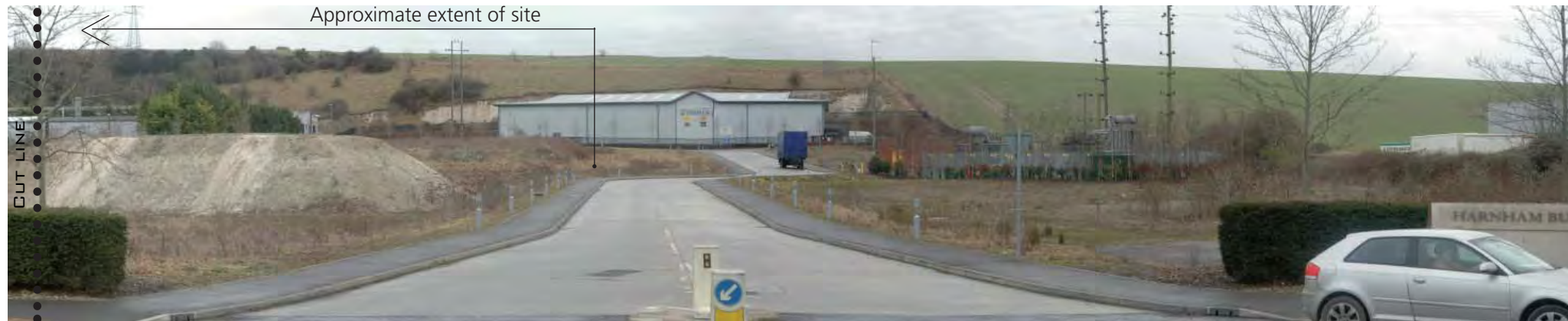
View from the A3094 looking south into the site.