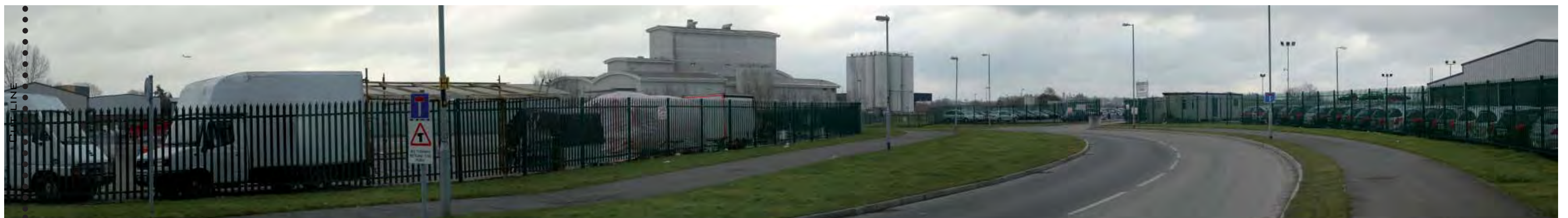
180 degree view looking south from main access road into the site.