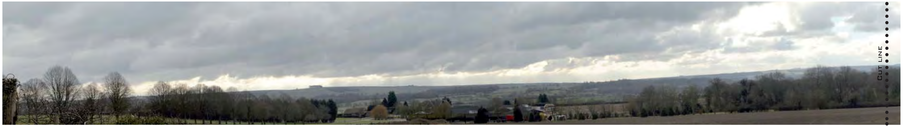
View looking west towards site from monument on A342.