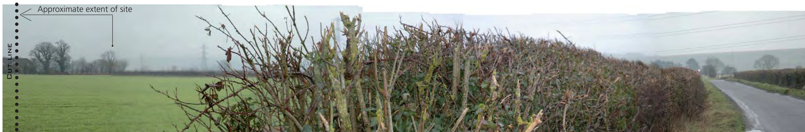
View looking east from Sharcott Drive toward the site.