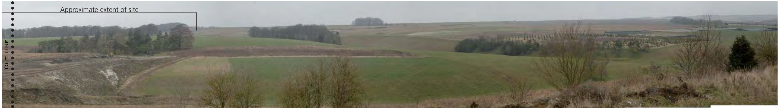
View looking south-west from entrance track off B390.