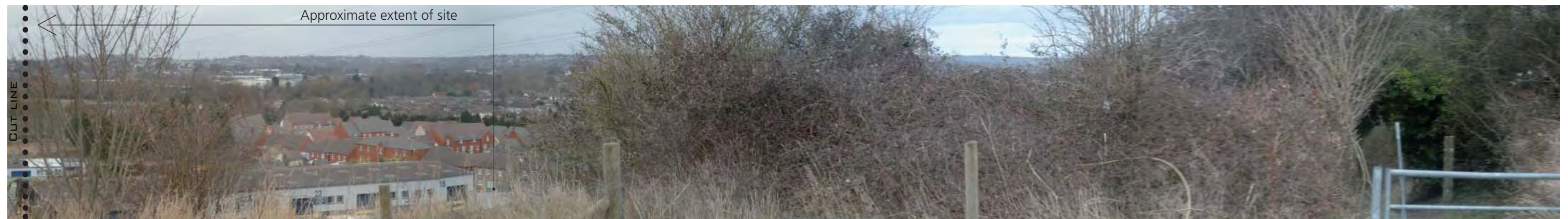
View from the public footpath overlooking the site to the south.