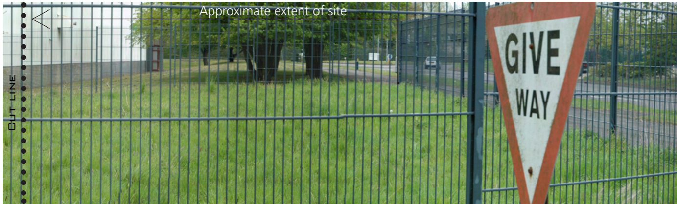
View looking north into site from as access gate on Edison Road south of the site.