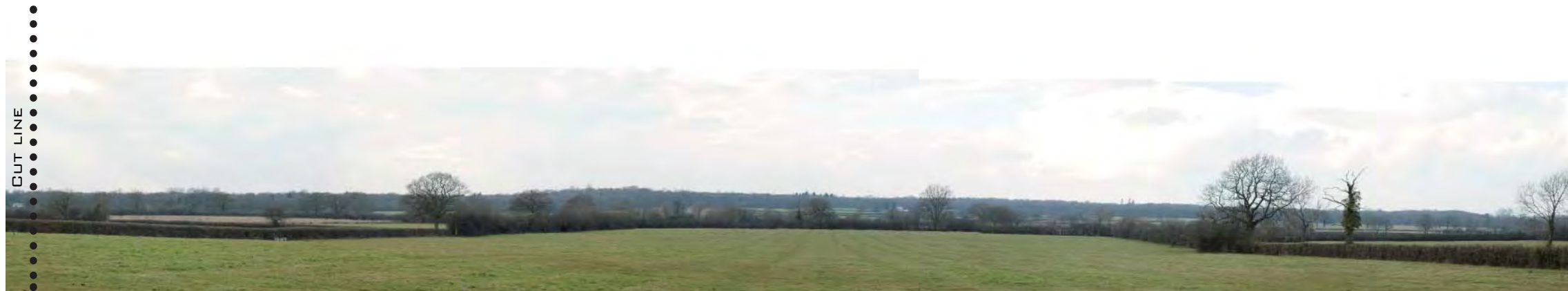
360 degree view from inside site looking towards Purton.