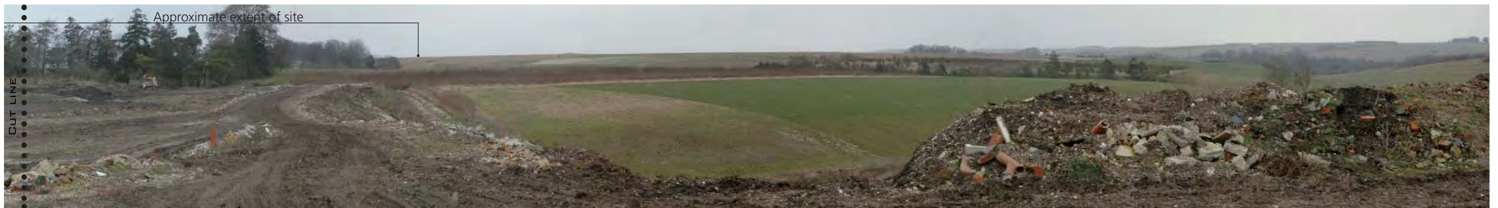
View looking south-eastern corner of the site.