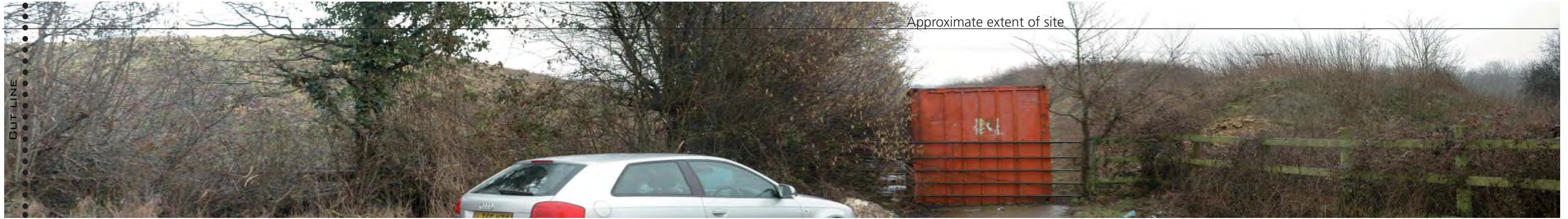
View looking east into site from access track running to the west of the site.