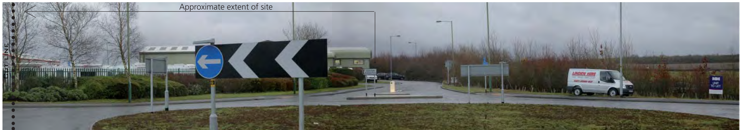
View looking south east from the residential development and the adjacent public highway bordering the sites northern boundary