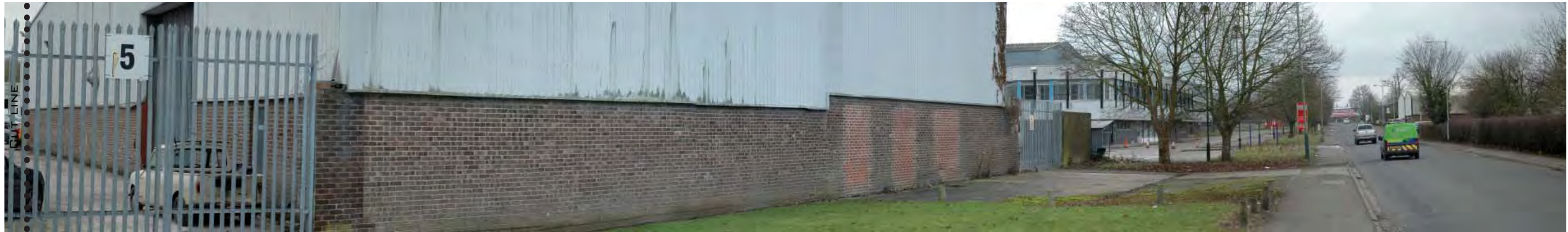
180 degree view looking south-east out of industrial estate towards 'The Ham' residential area.