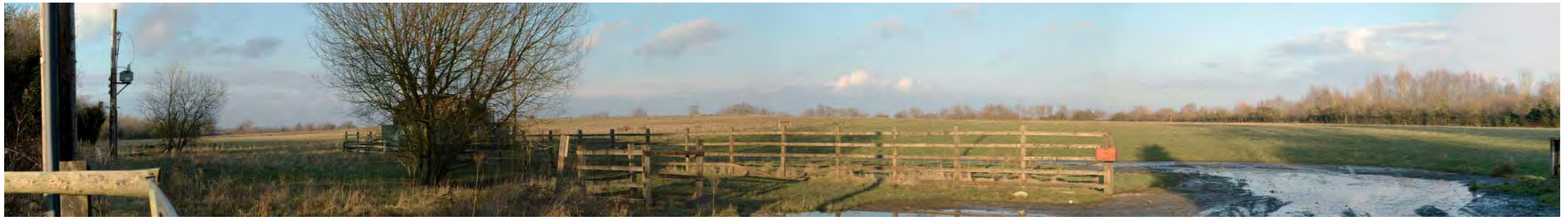
View looking into the site from the south-western corner / entrance.