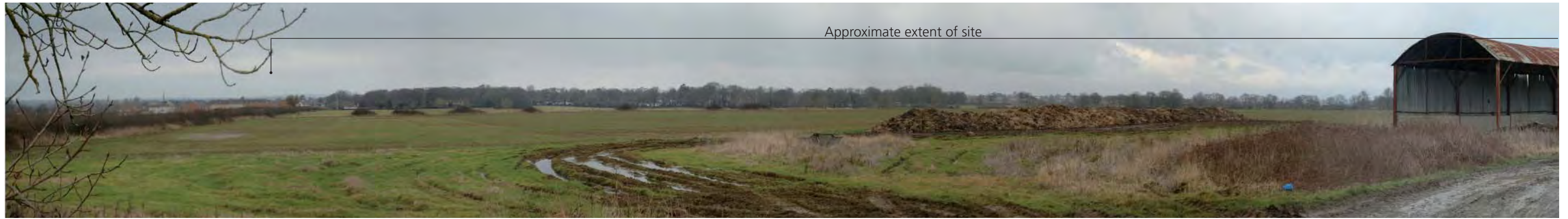
View looking north-west towards site from Biss Farm on West Ashton Road.