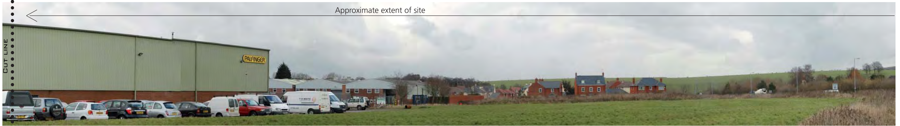
View from the A342 Nurstead Road looking east into the site.