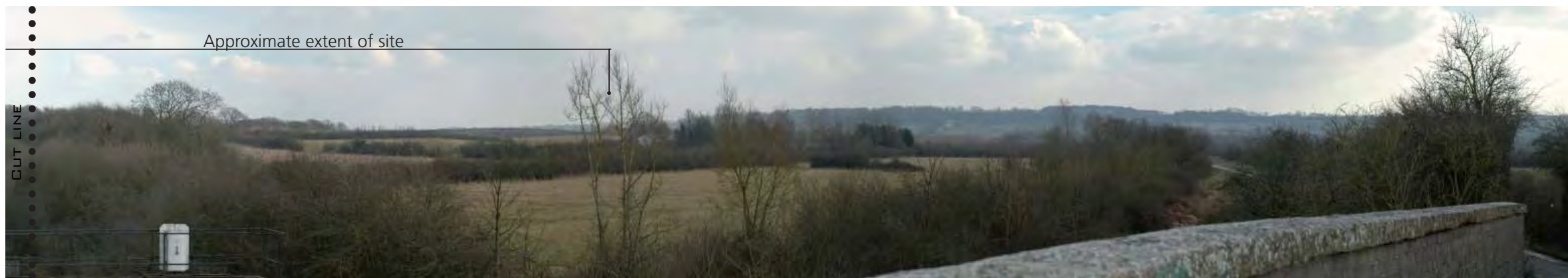
View looking east from railway bridge to the west of the site.