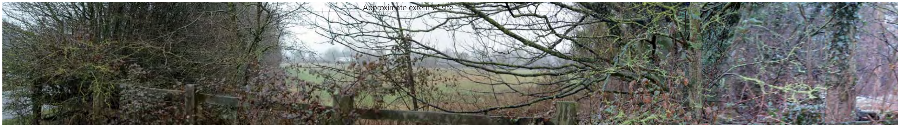
View looking north-west into the site from B4122.