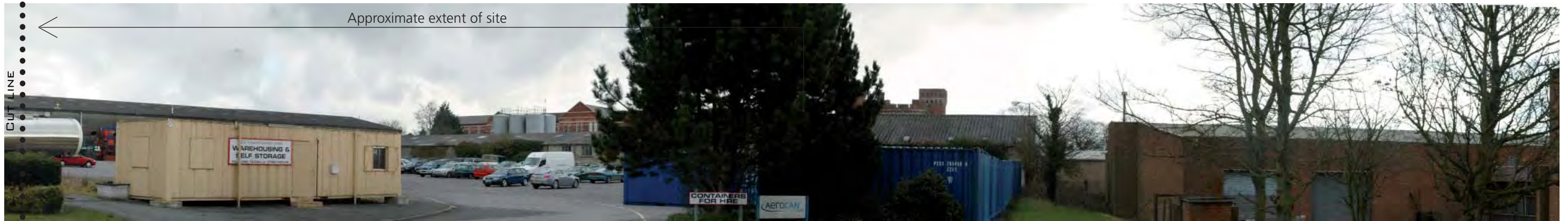
View from Folly Lane looking east into the site.