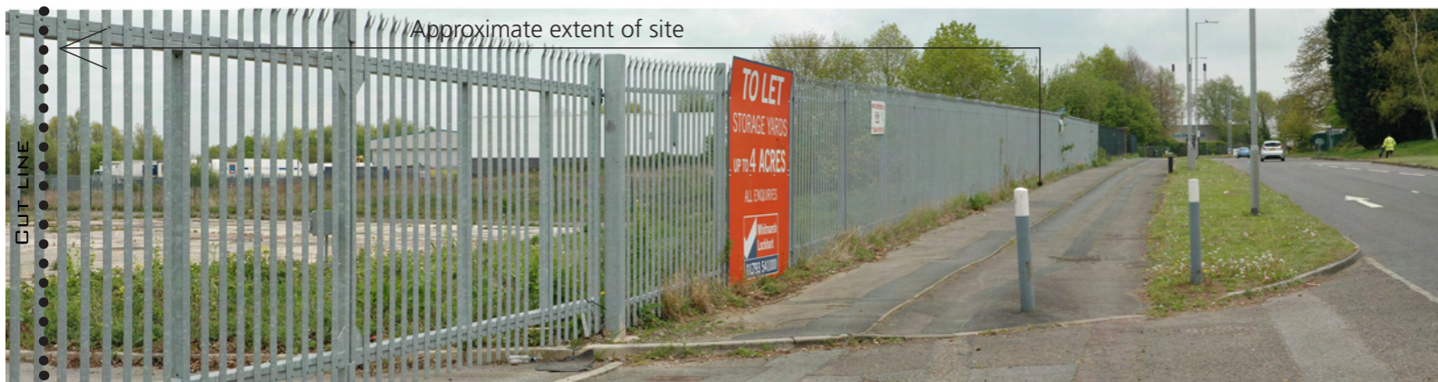
180 degree view looking north (west to east) into the site from Edison Road south of the site.