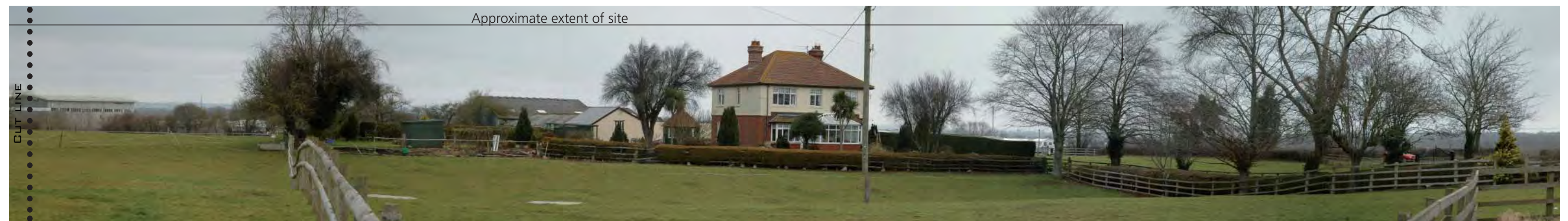
180 degree view looking north-west from 'The Ham' towards site.