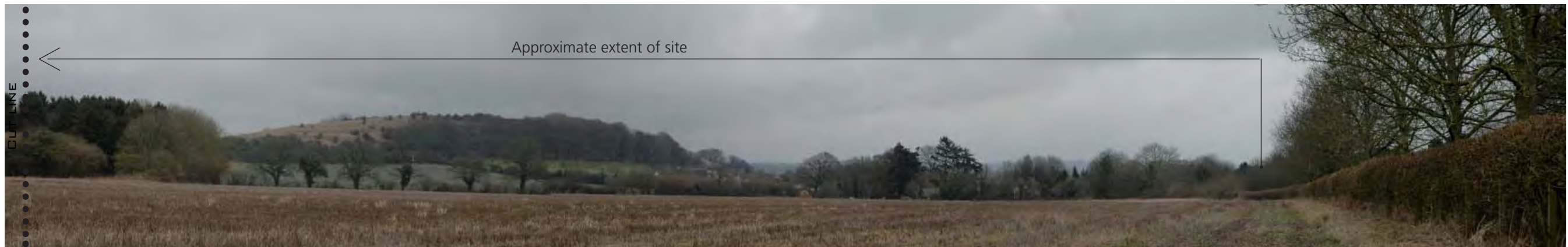
View from the B3092, looking north west through to east with the proposed site in the foreground and residential properties in Mere and Long Hill in the background.