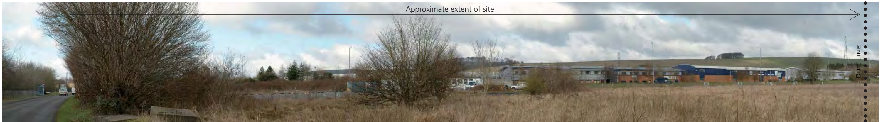
Approximate extent of site