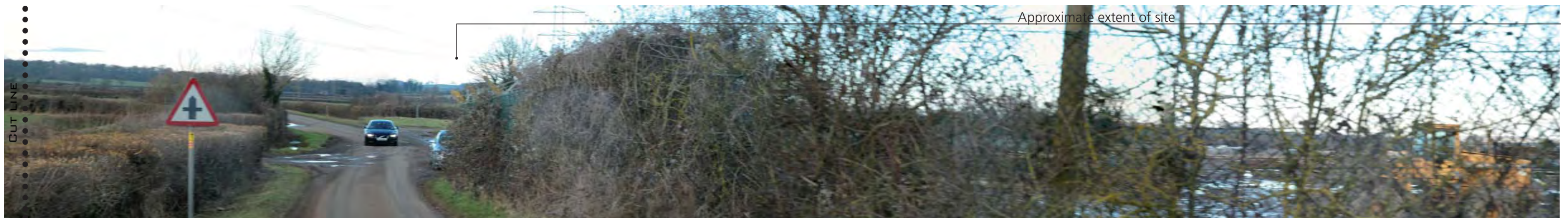
View looking into site from the railway bridge at the southern corner of the site.