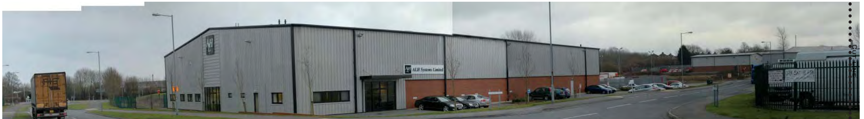
180 degree view looking north-west across site from access road on southern boundary of site.