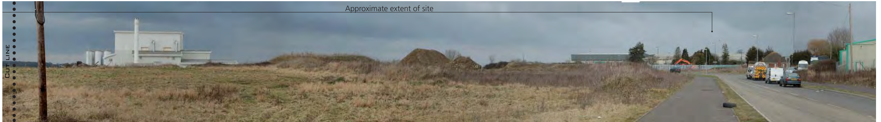
Approximate extent of site