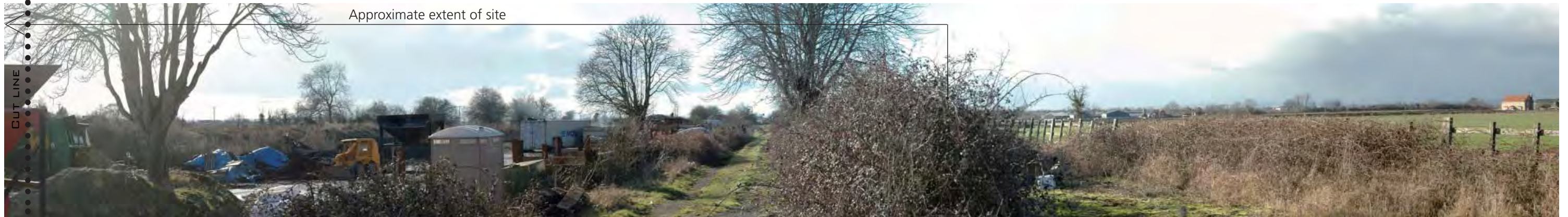
180 degree looking south from northern boundary of the site.