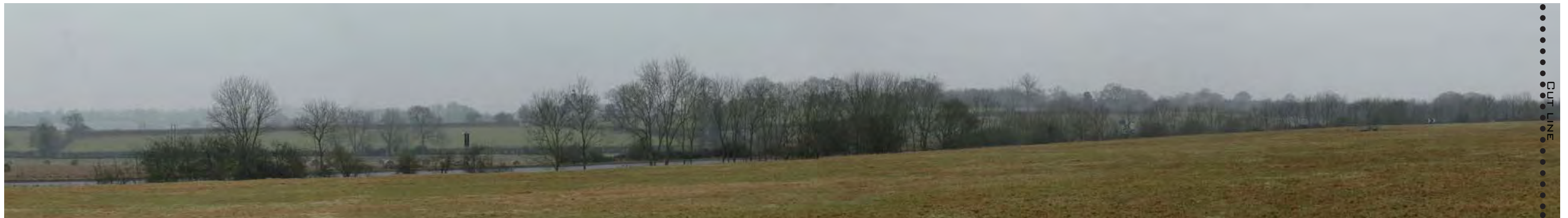
View from the centre of the site looking east