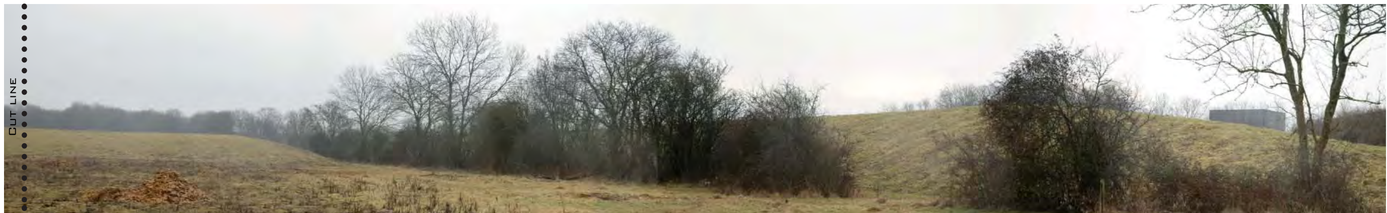
180 degree view looking south-east towards M4 motorway from within the site.