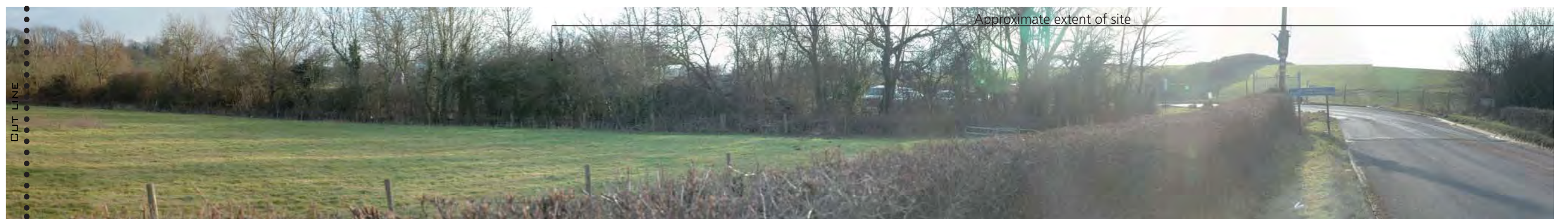
View looking west towards site entrance.