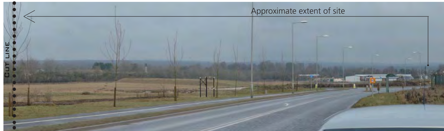
View from the A3026 looking north through to east into the site.