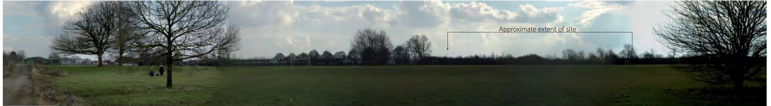
View looking south towards site from playing fields to the north of the site