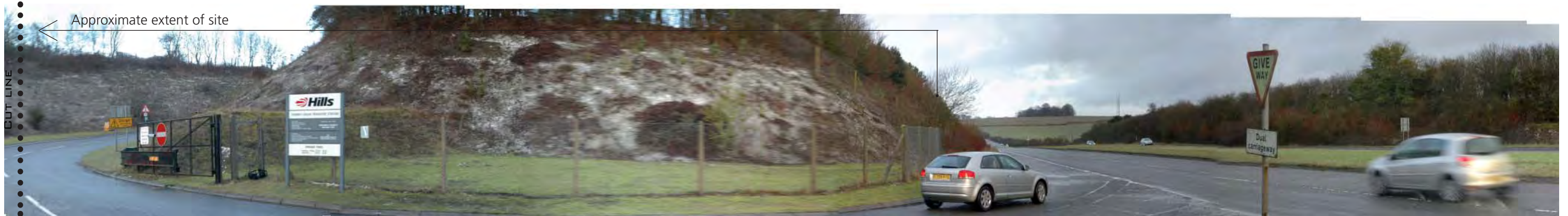
View looking north into the site from the main entrance accessed via the A30.