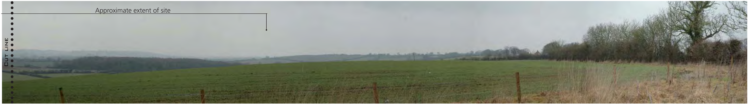
View looking south from entrance off B4042.