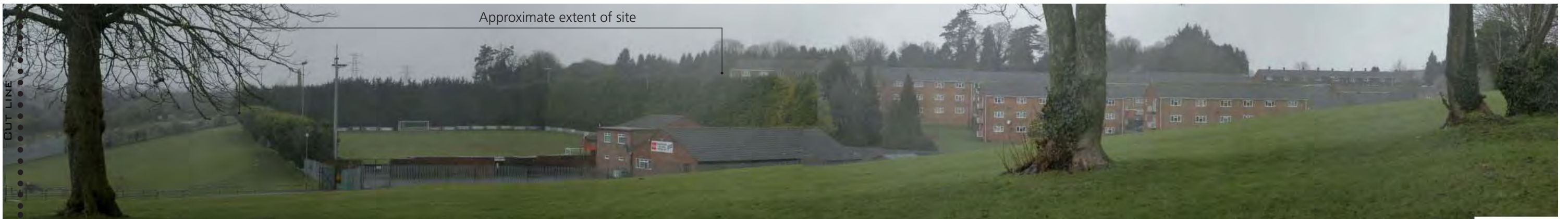
View from public land adjacent to Stanley Little Road looking west towards the site