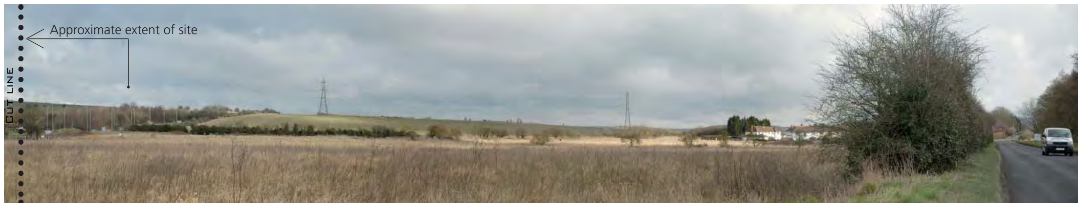
View looking north-west into site