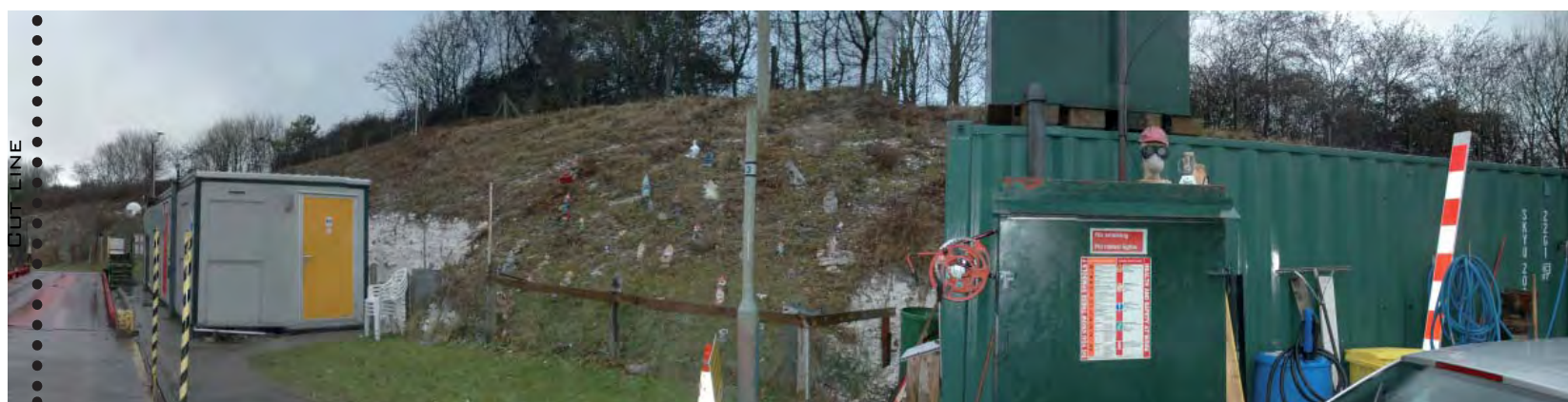
View from within the sites main compound area looking north east.