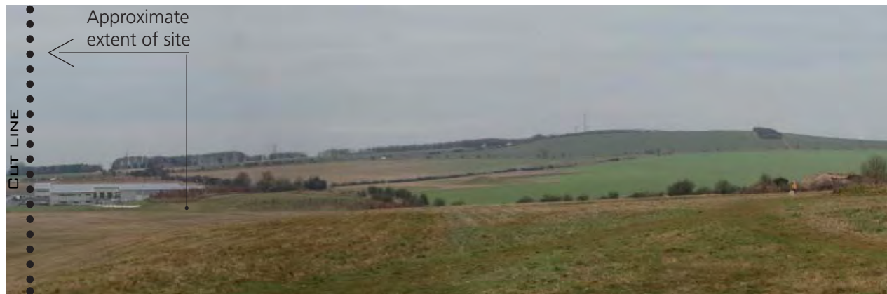
View looking north towards the Solstice Business Park site from residential properties and public footpath on northern outskirts of Amesbury.