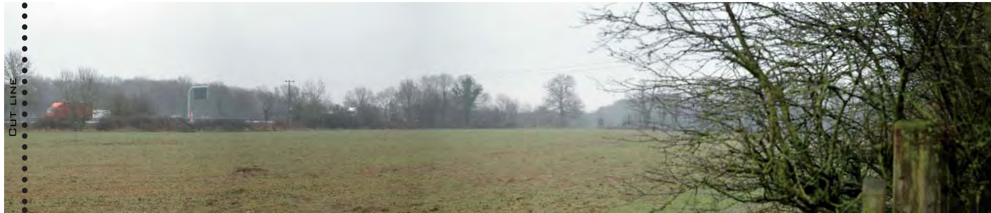
View looking north into the site from B4122.