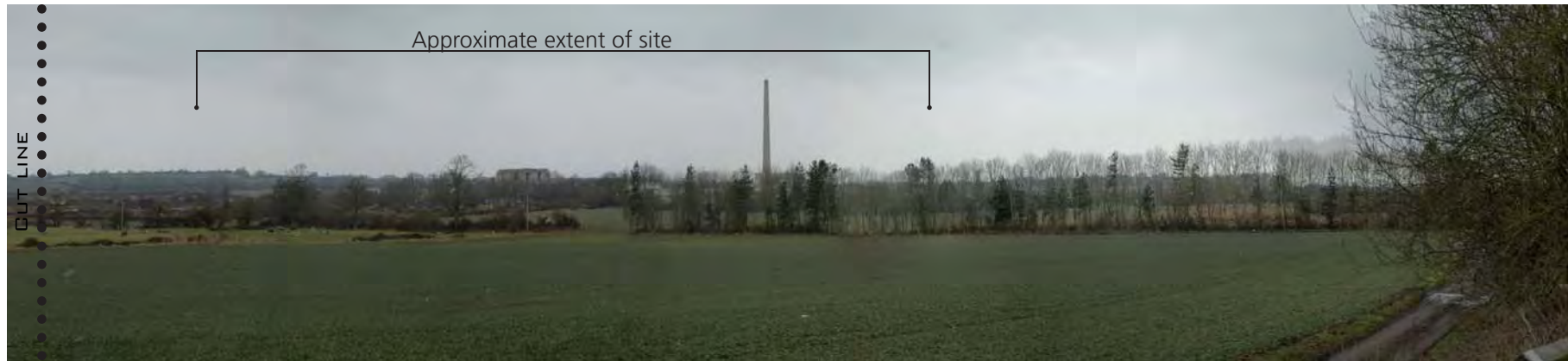
View looking north towards site from White Horse viewpoint on Bratton Road.