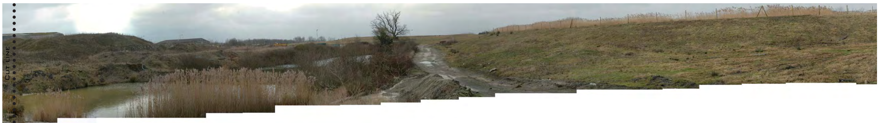
View looking south-east from centre of site towards Westbury White Horse.