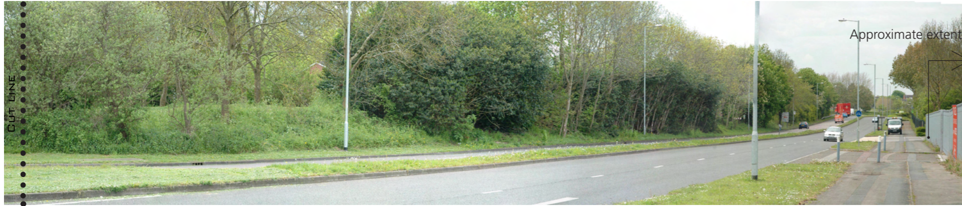
180 degree view looking south (east to west) towards adjacent industrial estate and residential properties south of the site.