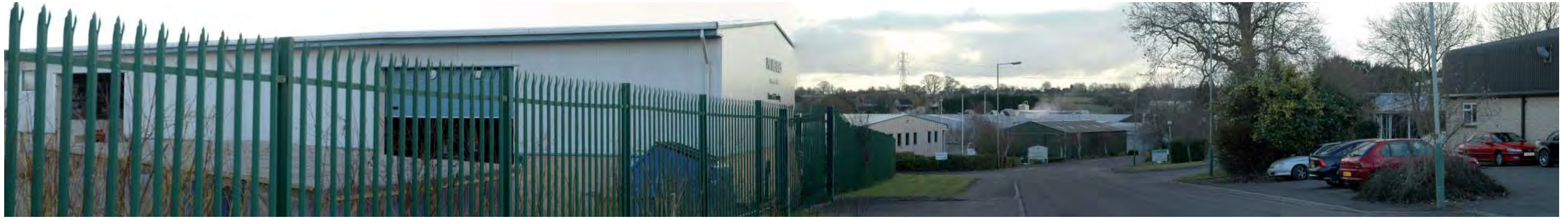
View looking south from Potley Lane.