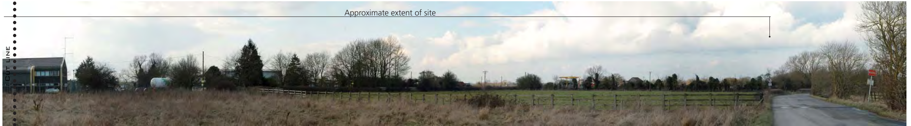
View looking west into the site from Mopes Lane.