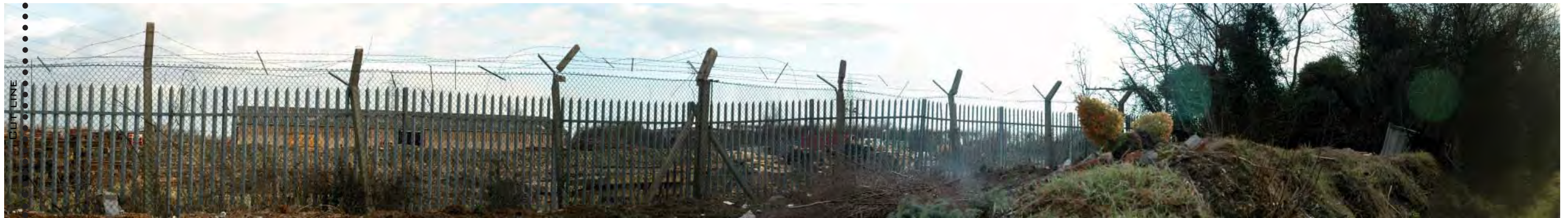
View looking south-east into site from track running along north-western boundary.