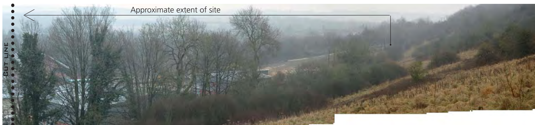
View from the public footpath on Postern Hill to the south of the site looking west through to east down into the site.