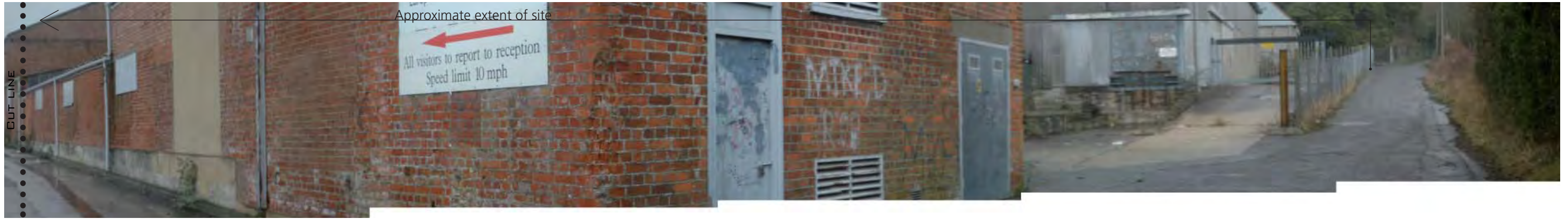
View from lane adjacent to site entrance looking west toward the site.