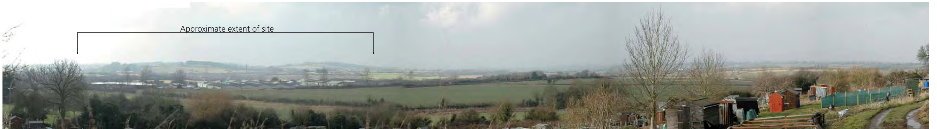
View looking west towards site from allotments off Church Street, Wootton Bassett.