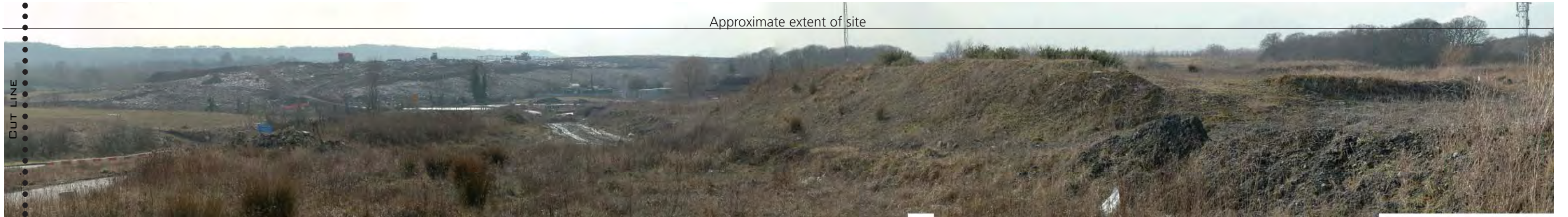
View looking south public footpath running through the site.