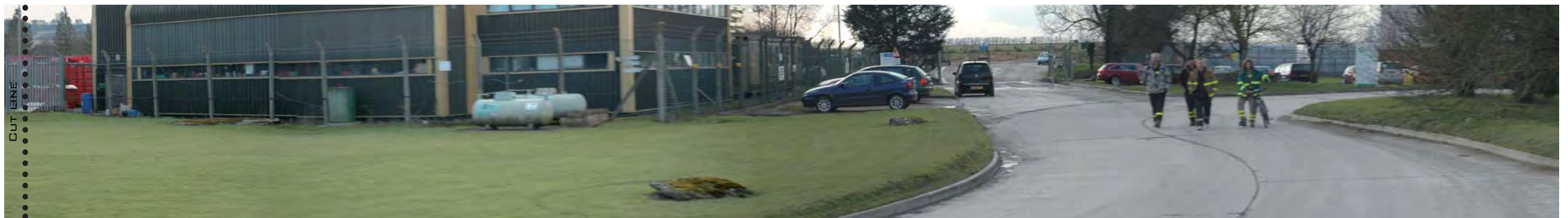
View looking south-west from within site.