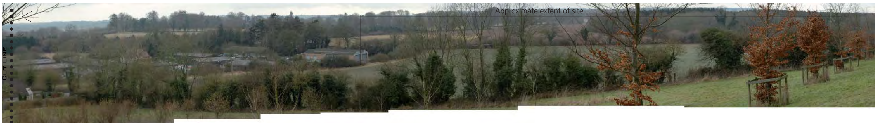
View from a public footpath near Long Hill, looking south through to south west toward the site.