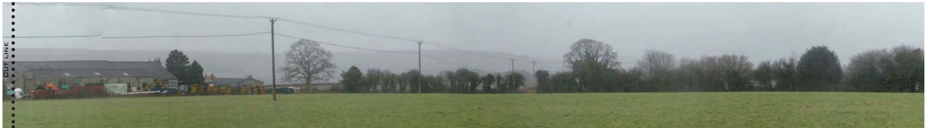
View looking south from the public footpath to the north of the site.