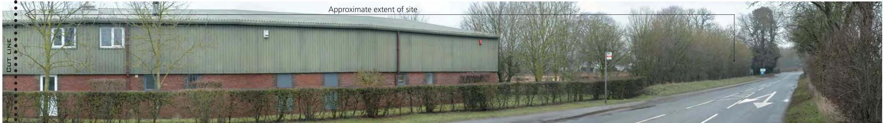
View from the site entrance at the A345 looking north into the site.