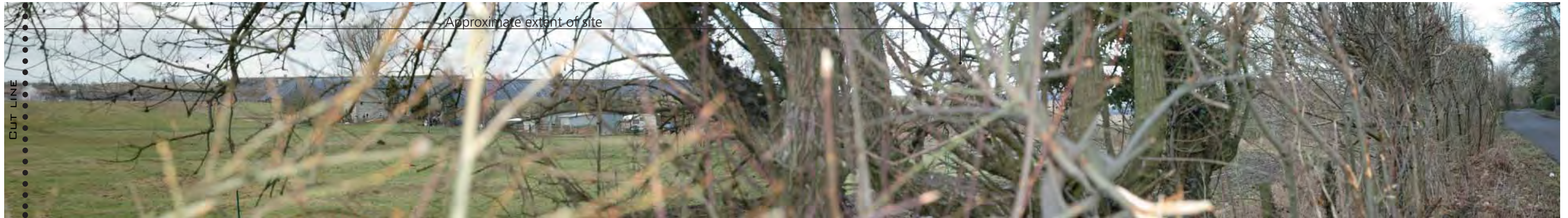
View looking west into the site from local minor road.